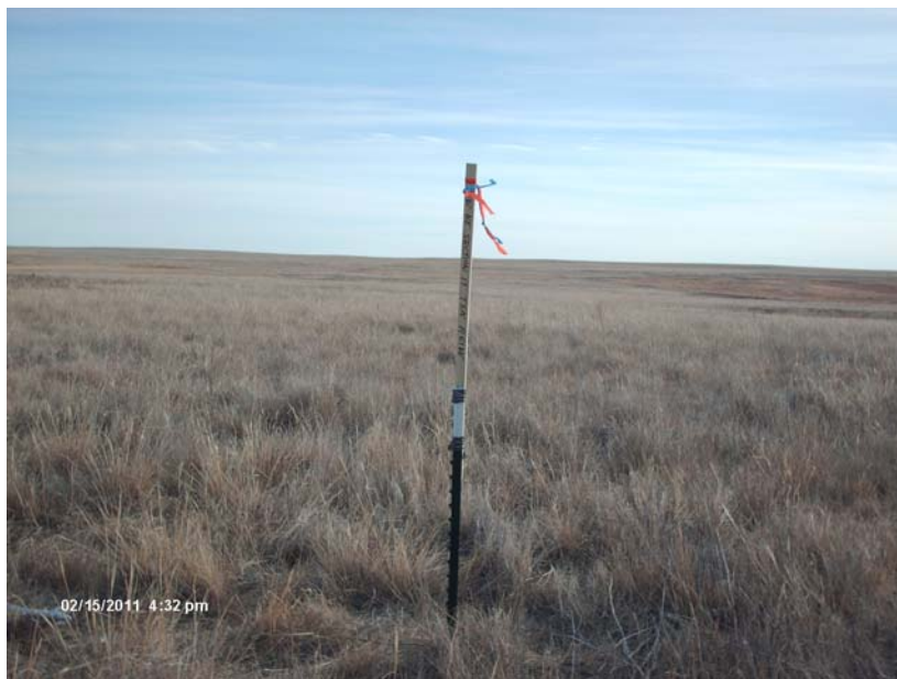
PRONGHORN 31-17 HZ NW ¼ NE ¼ SECTION 17 T5N R61W LOOKING SOUTH FEBRUARY 15, 2011