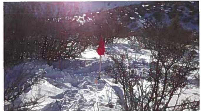
WELL LOCATION LOOKING WEST FEBRUARY 16, 2011