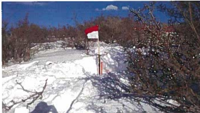
WELL LOCATION LOOKING EAST FEBRUARY 16, 2011