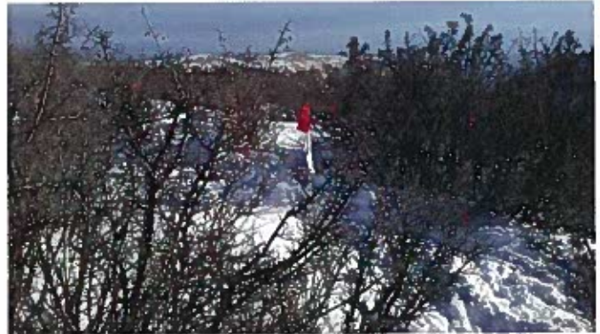
WELL LOCATION LOOKING SOUTH FEBRUARY 16, 2011