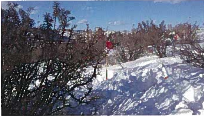
WELL LOCATION LOOKING NORTH FEBRUARY 16, 2011