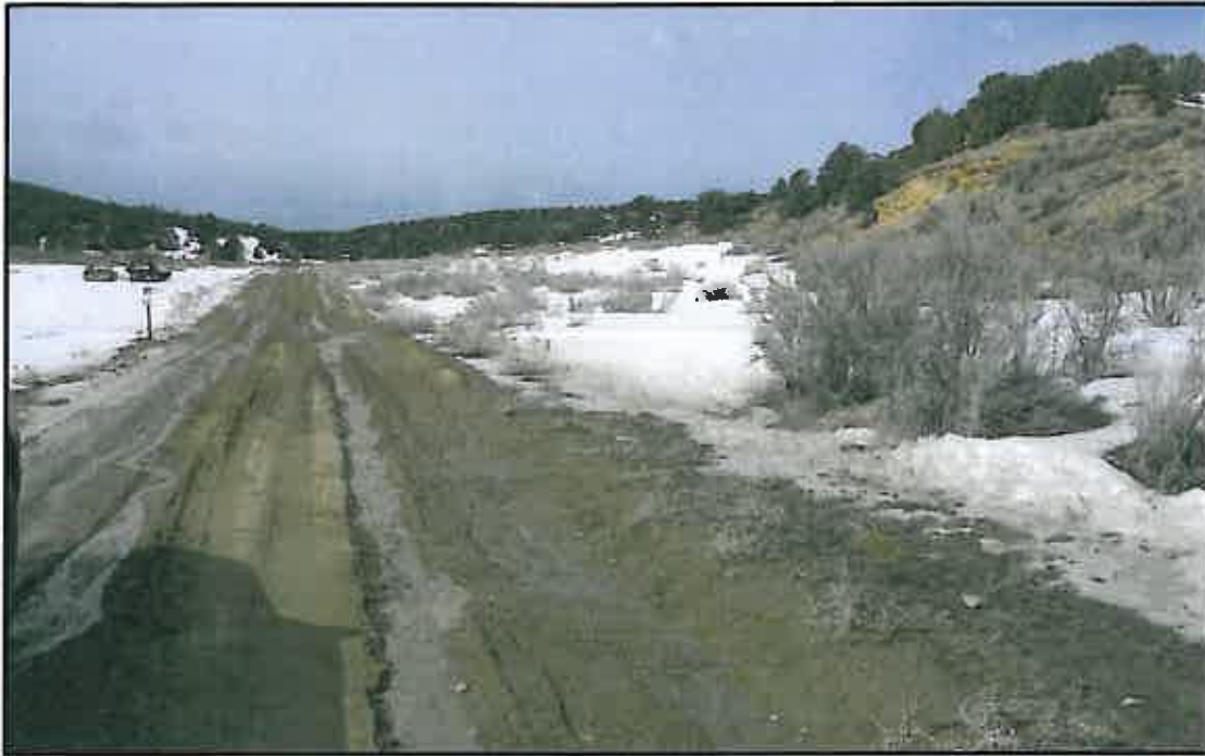
PHOTO: VIEW OVERALL