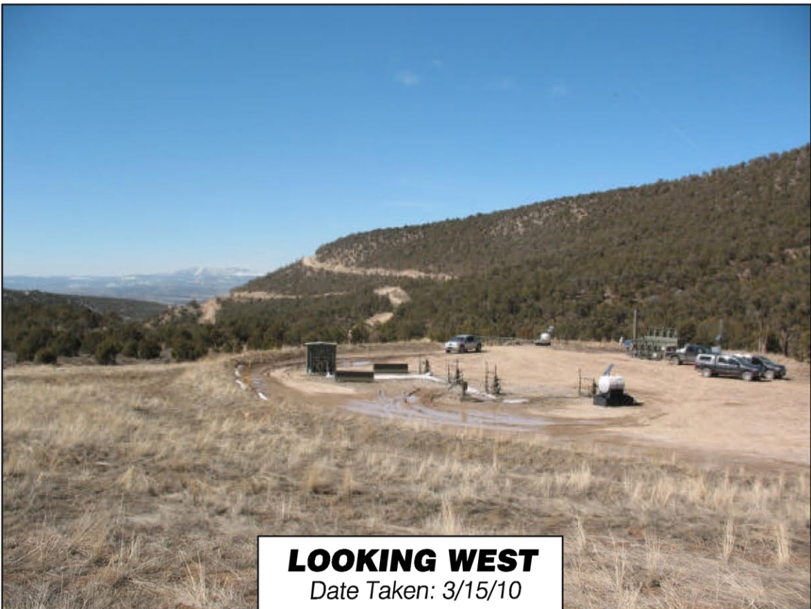
LOOKING WEST Date Taken: 3/15/10