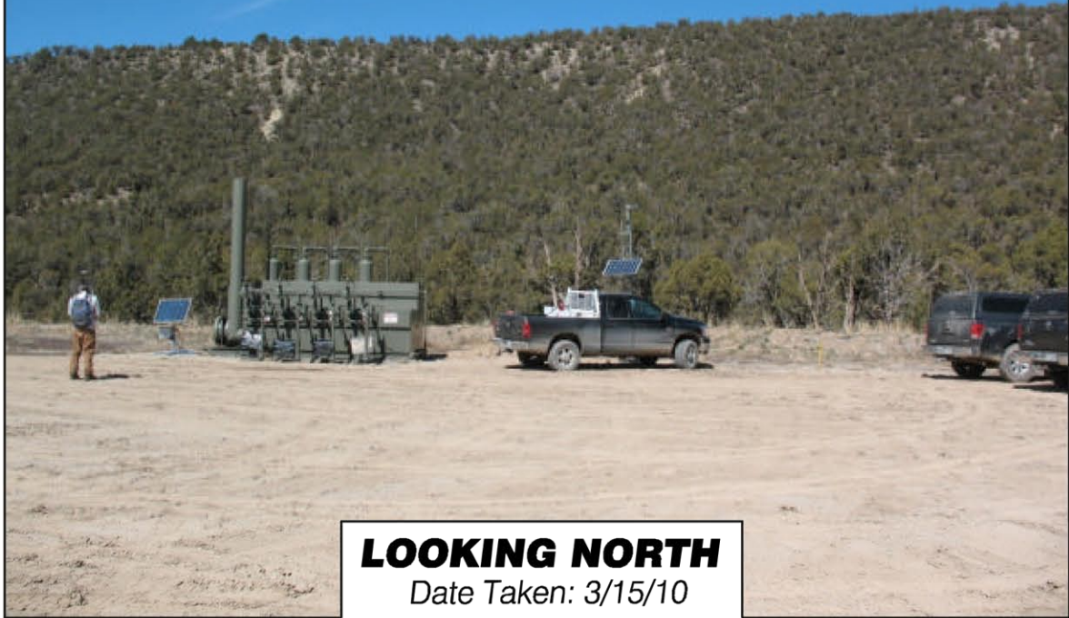
LOOKING NORTH Date Taken: 3/15/10