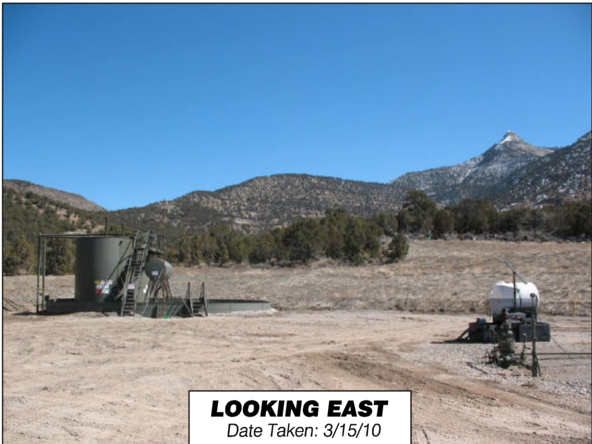
LOOKING EAST Date Taken: 3/15/10