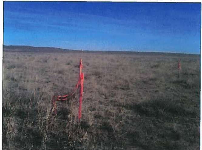
FRENCH LAKE 4-63-36-1M East.jpg