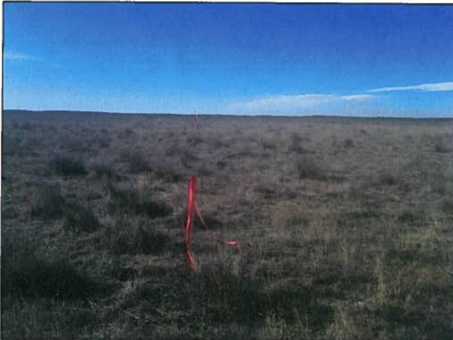
FRENCH LAKE 4-63-36-1M West.jpg