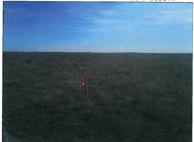
FRENCH LAKE 4-63-36-1M South.jpg