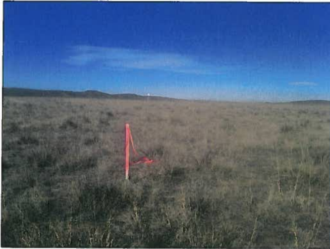
FRENCH LAKE 4-63-36-1M North.jpg