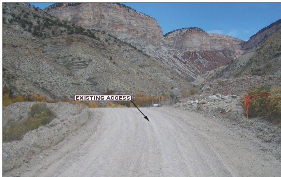
PHOTO: VIEW OF EXISTING ACCESS