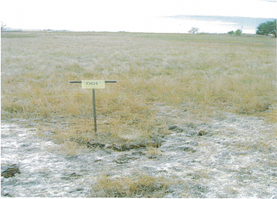
Figure 2. Sample Point 001 Facing Southeast