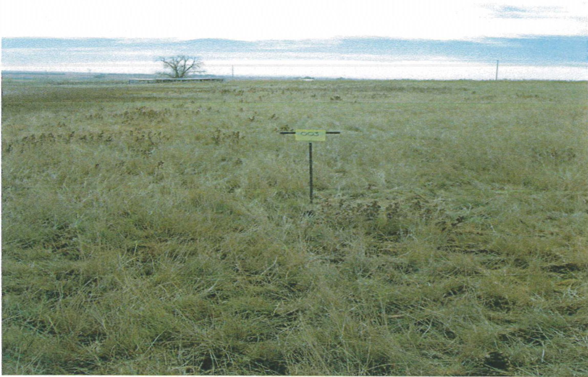
Figure 4. Sample Point 003 Facing Southeast