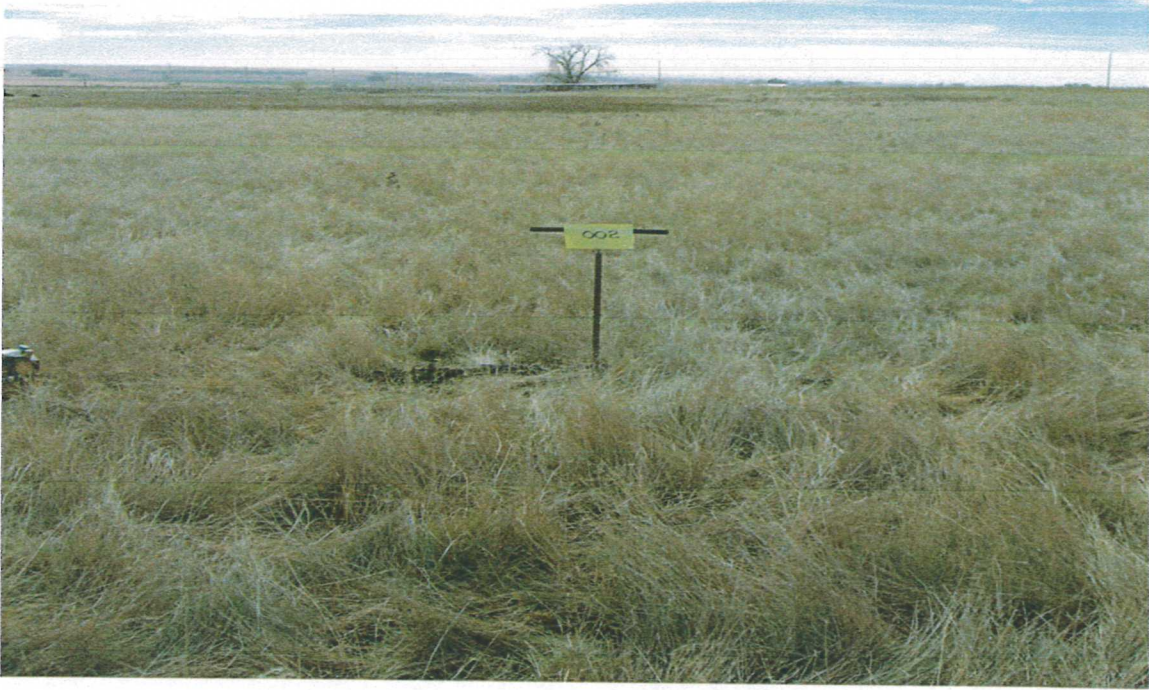
Figure 3. Sample Point 002 Facing Southeast