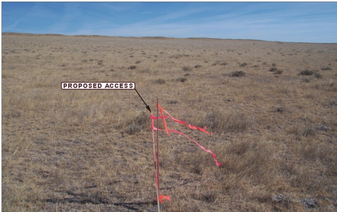
PHOTO: VIEW OF PROPOSED ACCESS