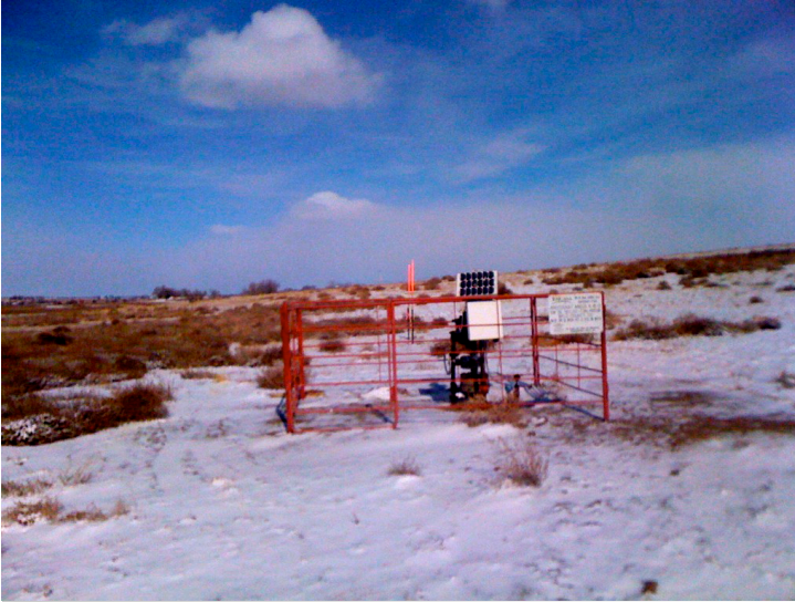
ARISTOCRAT ANGUS WELLS • NORTH VIEW

SHL: SW1/4 OF SE-1/4 SECTION 2-T3N-R65W-6 TH PM WELD COUNTY, COLORADO