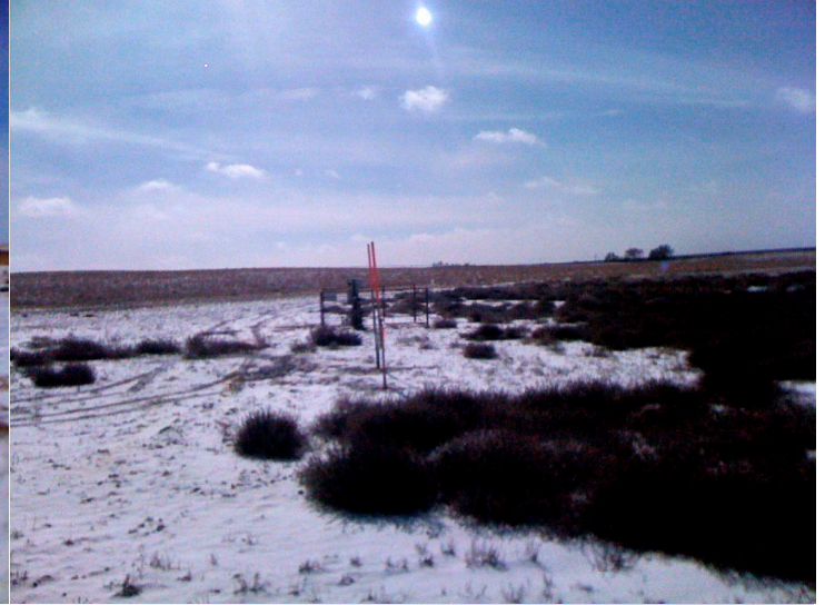
ARISTOCRAT ANGUS WELLS • SOUTH VIEW