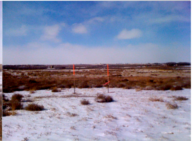
ARISTOCRAT ANGUS WELLS • WEST VIEW