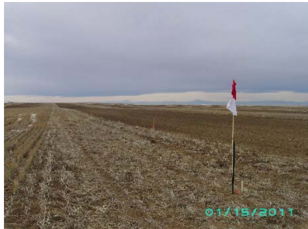
WELL LOCATION LOOKING WEST