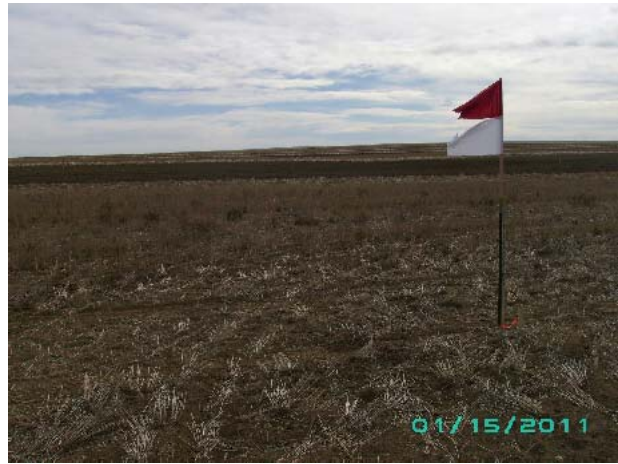
WELL LOCATION LOOKING SOUTH