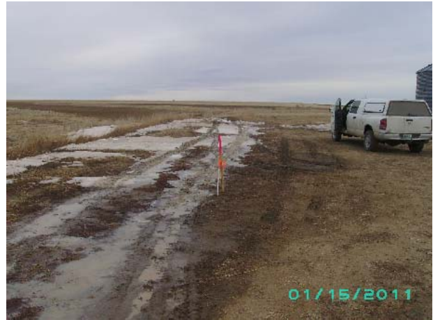
PROPOSED ACCESS TAKE-OFF LOOKING NORTHEASTERLY