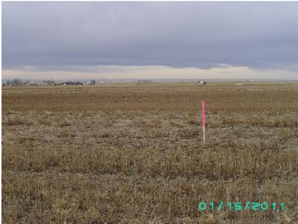
PROPOSED ACCESS AT PAD LOOKING NORTHWESTERLY