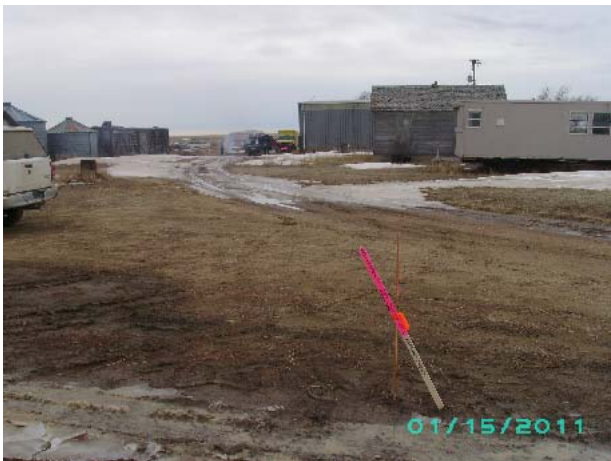
PROPOSED ACCESS TAKE-OFF LOOKING SOUTHERLY