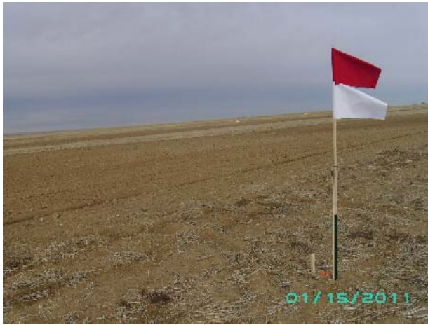
WELL LOCATION LOOKING NORTH