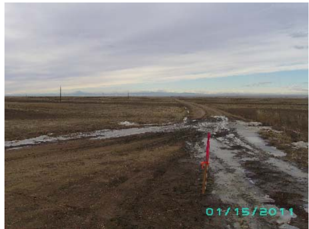
PROPOSED ACCESS TAKE-OFF LOOKING WESTERLY