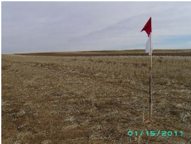
WELL LOCATION LOOKING EAST