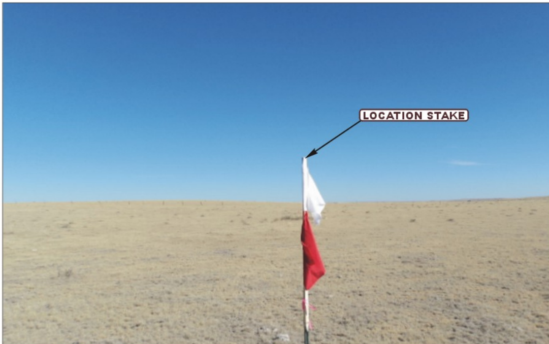
PHOTO: VIEW OF LOCATION STAKE