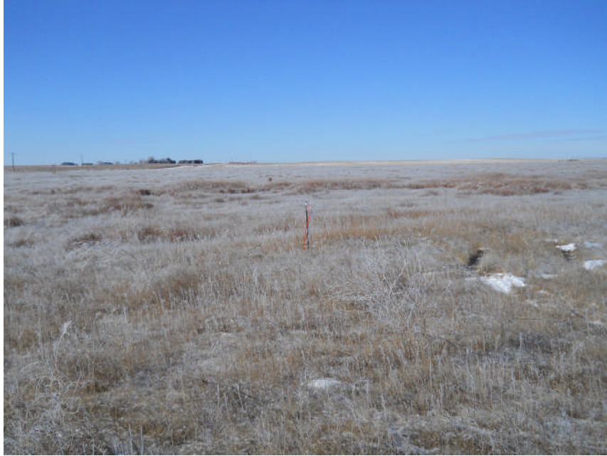
Fulscher 943-16-34 SW ¼ SE ¼ SEC. 16, T9N, R43W Looking West 20 January, 2011