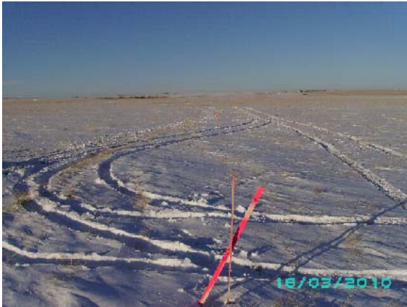
PROPOSED ACCESS AT STAKED ROAD LOOKING NORTH