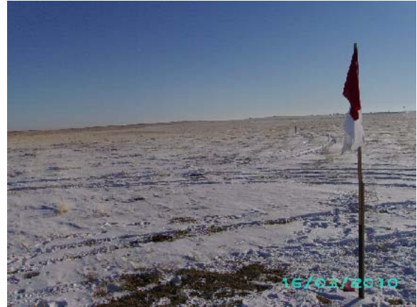
WELL LOCATION LOOKING SOUTH