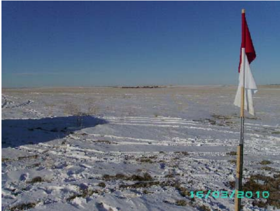
WELL LOCATION LOOKING NORTH