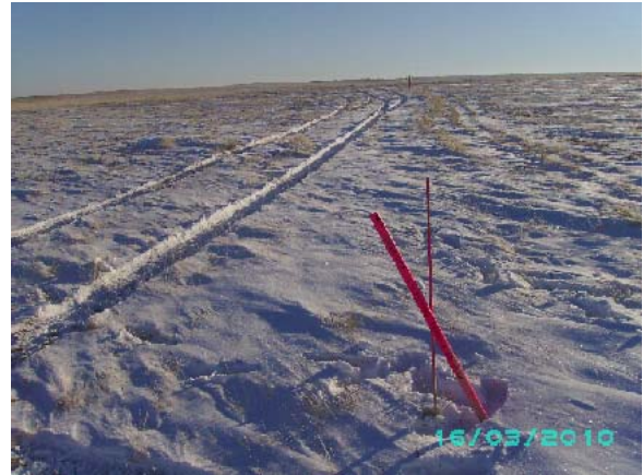
PROPOSED ACCESS AT STAKED ROAD LOOKING SOUTH