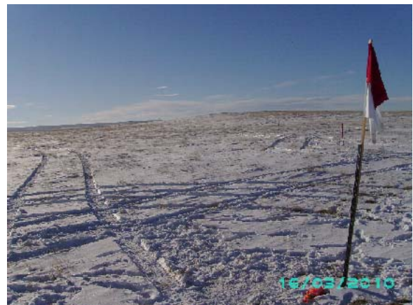
WELL LOCATION LOOKING WEST