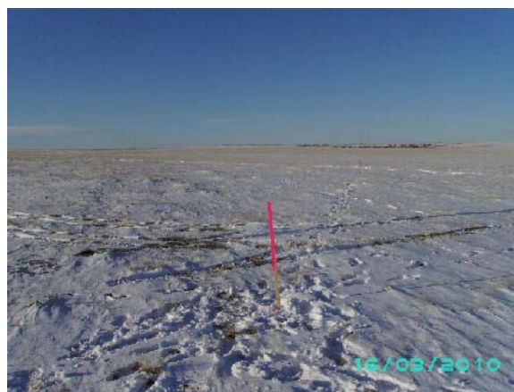
PROPOSED ACCESS AT PAD