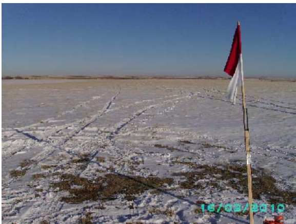
WELL LOCATION LOOKING EAST