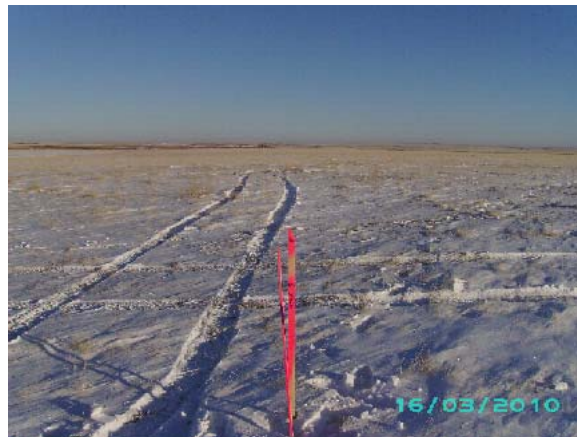
PROPOSED ACCESS AT STAKED ROAD LOOKING EAST