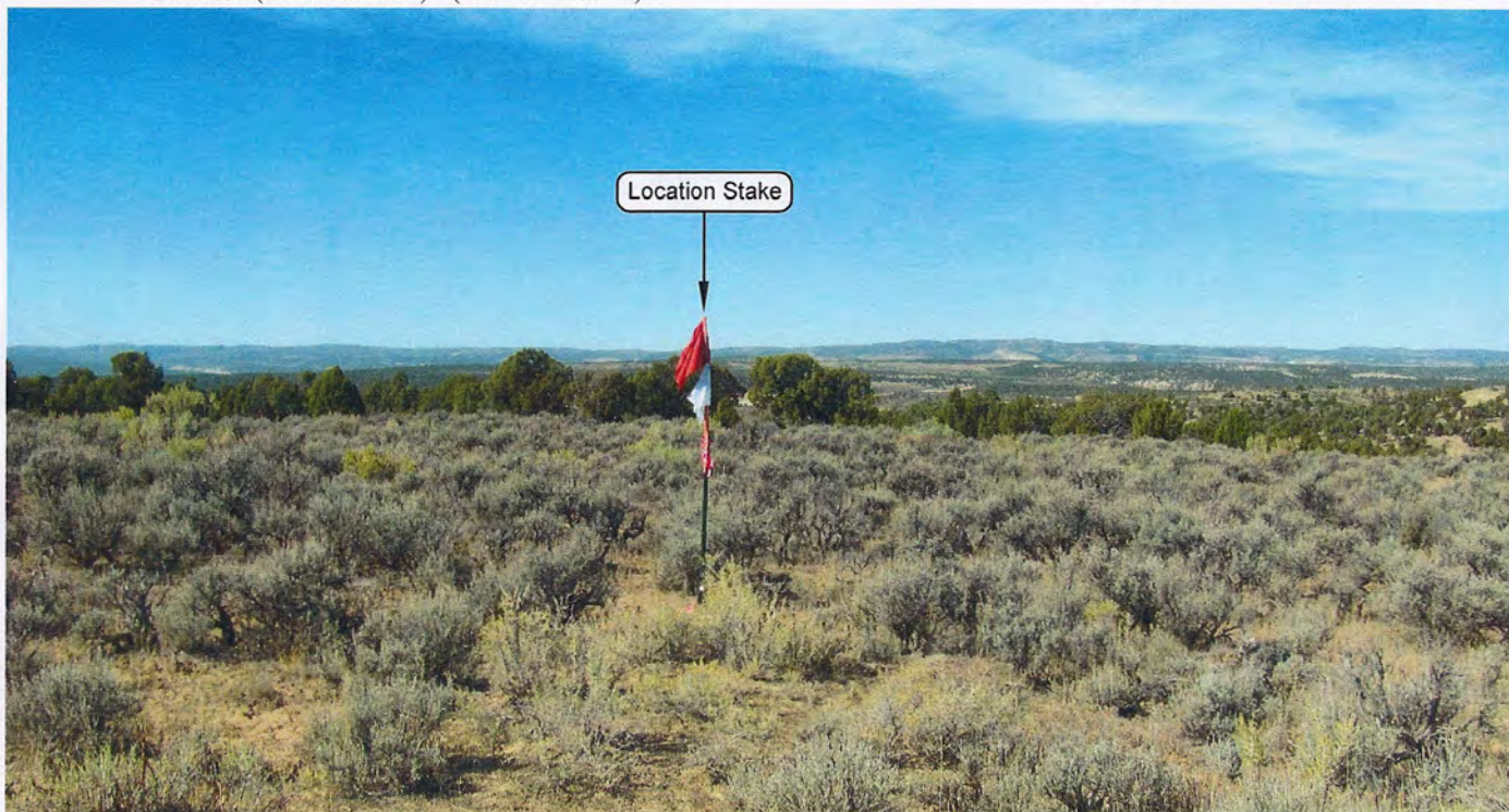
PHOTO LOCATION: LATITUDE LONGITUDE NAD 83: (40° 00' 30.21"N) (108° 19' 20.62"W)