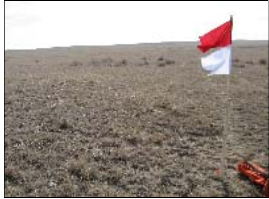
WELL LOCATION LOOKING SOUTH