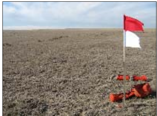
WELL LOCATION LOOKING WEST