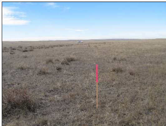
PROPOSED ACCESS AT PAD