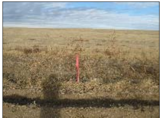
PROPOSED ACCESS TAKE-OFF