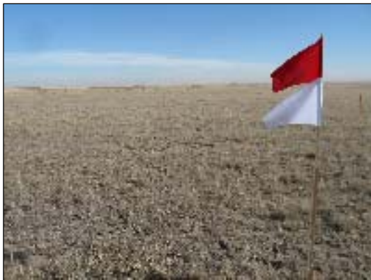
WELL LOCATION LOOKING EAST