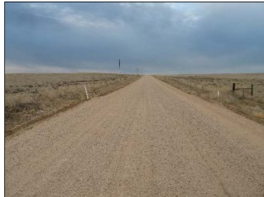
PROPOSED ACCESS COUNTY ROAD 79 LOOKING WEST