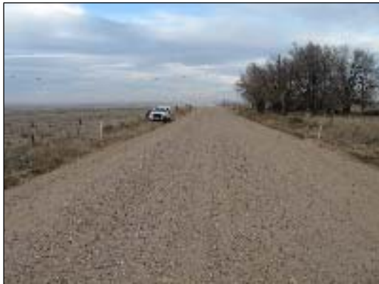
PROPOSED ACCESS AT COUNTY ROAD 79 LOOKING EAST