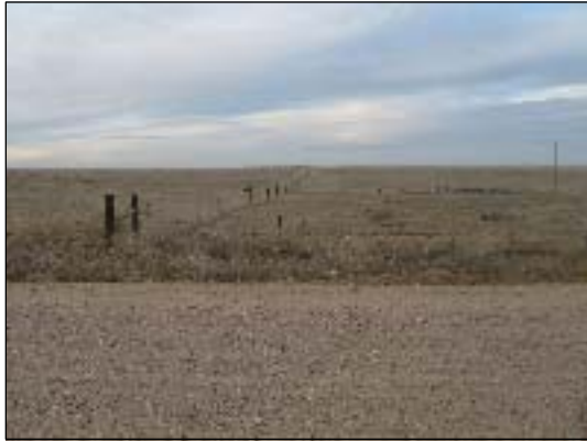
PROPOSED ACCESS AT COUNTY ROAD 79 LOOKING NORTH