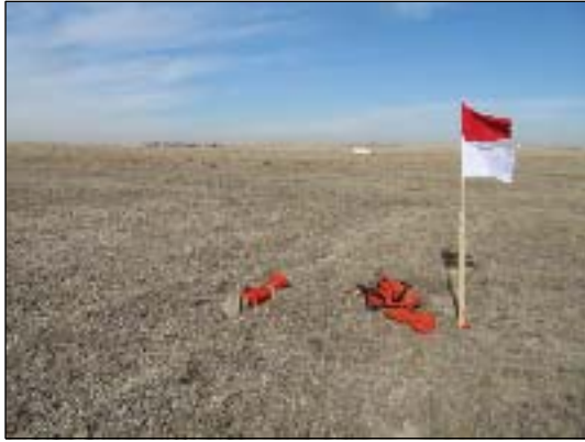
WELL LOCATION LOOKING NORTH