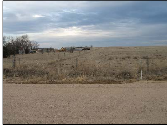
PROPOSED ACCESS COUNTY ROAD 79 LOOKING SOUTH