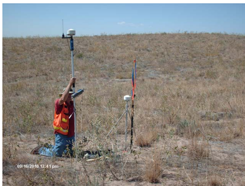
ANTELOPE G-31 PAD SITE SE 1/4 NW 1/4 SEC. 31 T5N R62W Looking WEST SEPTEMBER 16, 2010