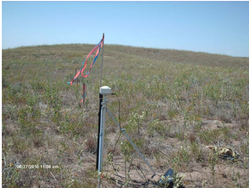
ANTELOPE I-31 PAD SITE NE 1/4 SW 1/4 SEC. 31 T5N R62W Looking SOUTH AUGUST 27, 2010