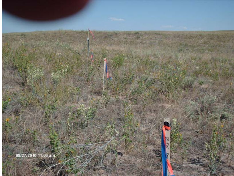
ANTELOPE I-31 PAD SITE NE 1/4 SW 1/4 SEC. 31 T5N R62W Looking NORTH AUGUST 27, 2010