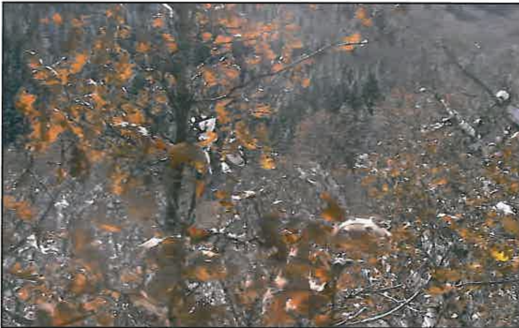
PHOTO: VIEW FROM PAD CENTER