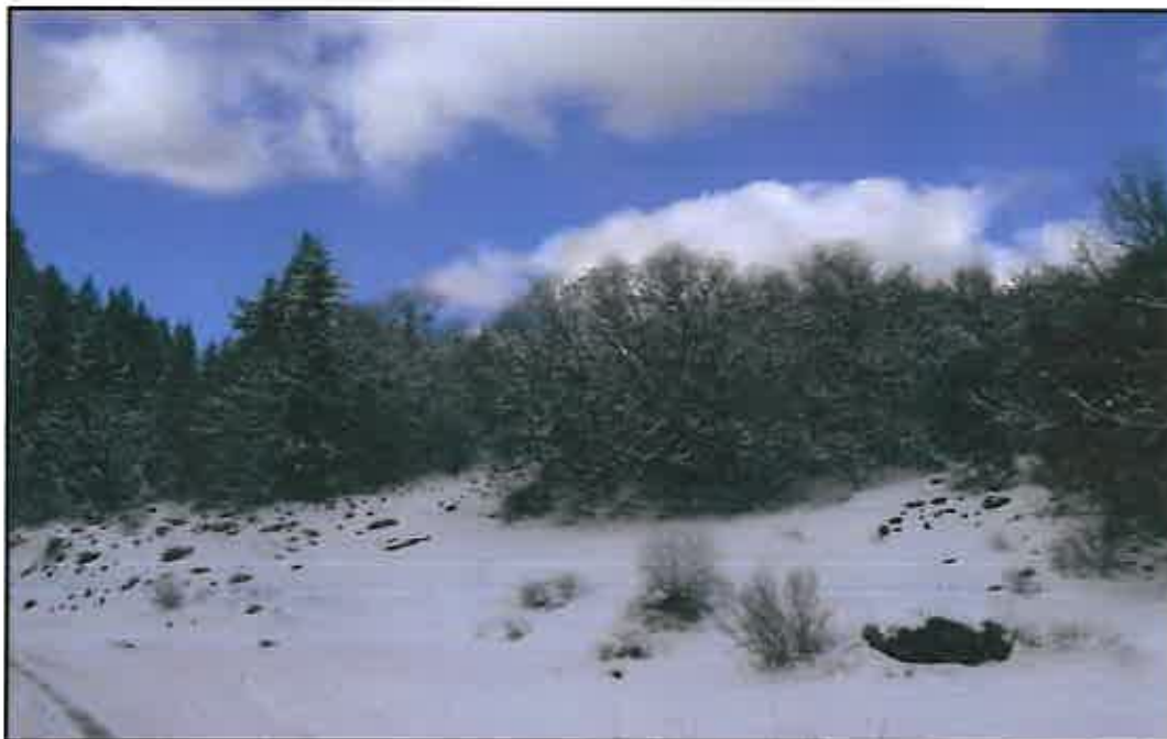
PHOTO: VIEW OF PROPOSED ACCESS ROAD