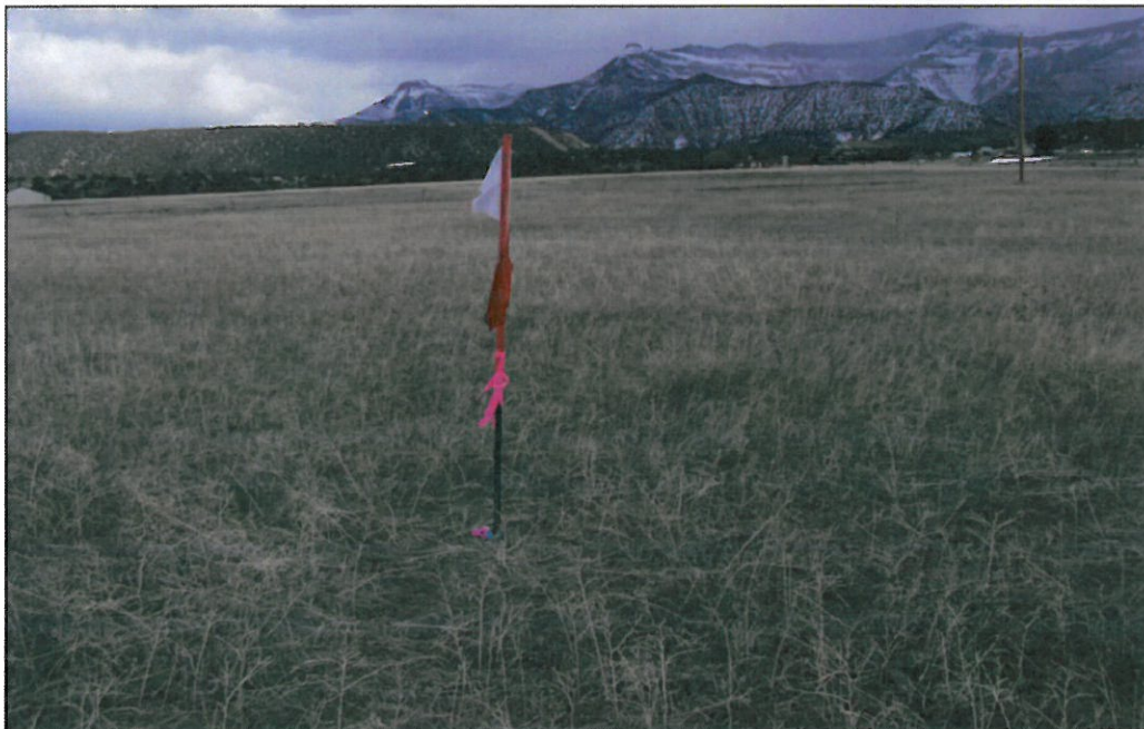
PHOTO: VIEW OF LOCATION CENTER STAKE