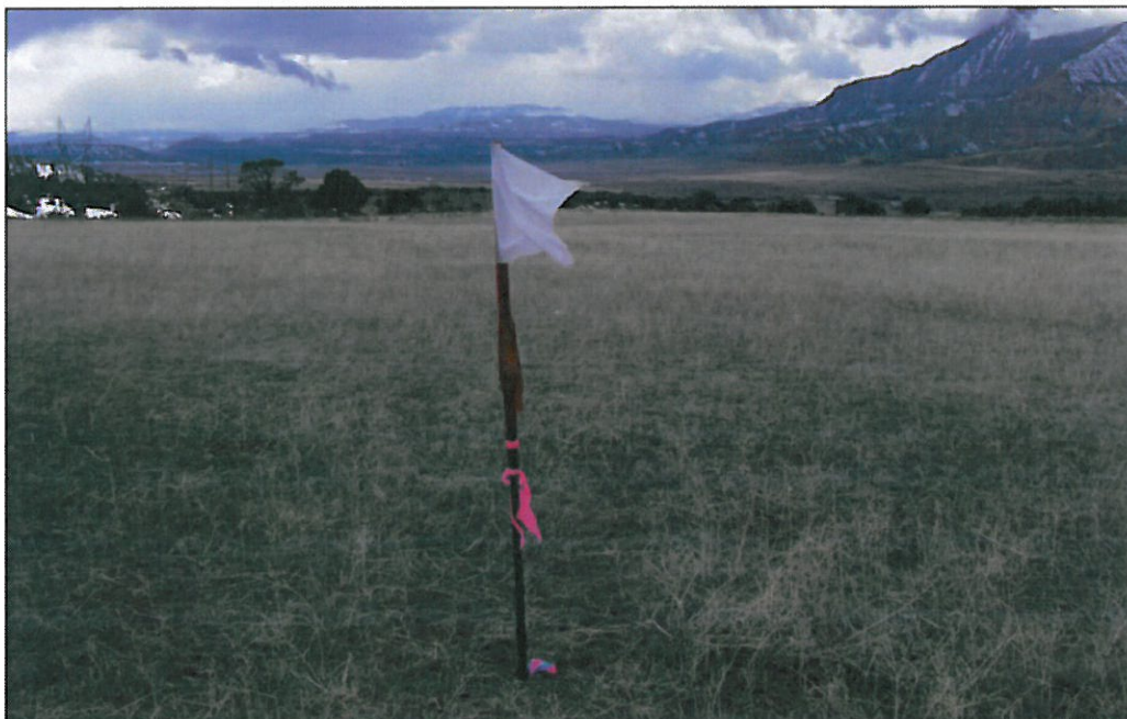
PHOTO: VIEW OF LOCATION CENTER STAKE