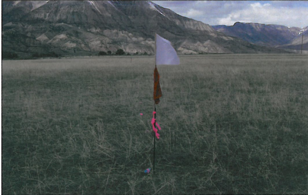
PHOTO: VIEW OF LOCATION CENTER STAKE

PROPOSED SG 13-35, SG 23-35, SG 313-35, SG 323-35, SG 413-35, SG 423-35, SG 523-35 LOCATED IN GARFIELD COUNTY, COLORADO SECTION 35, T7S, R96W, 6th P.M.