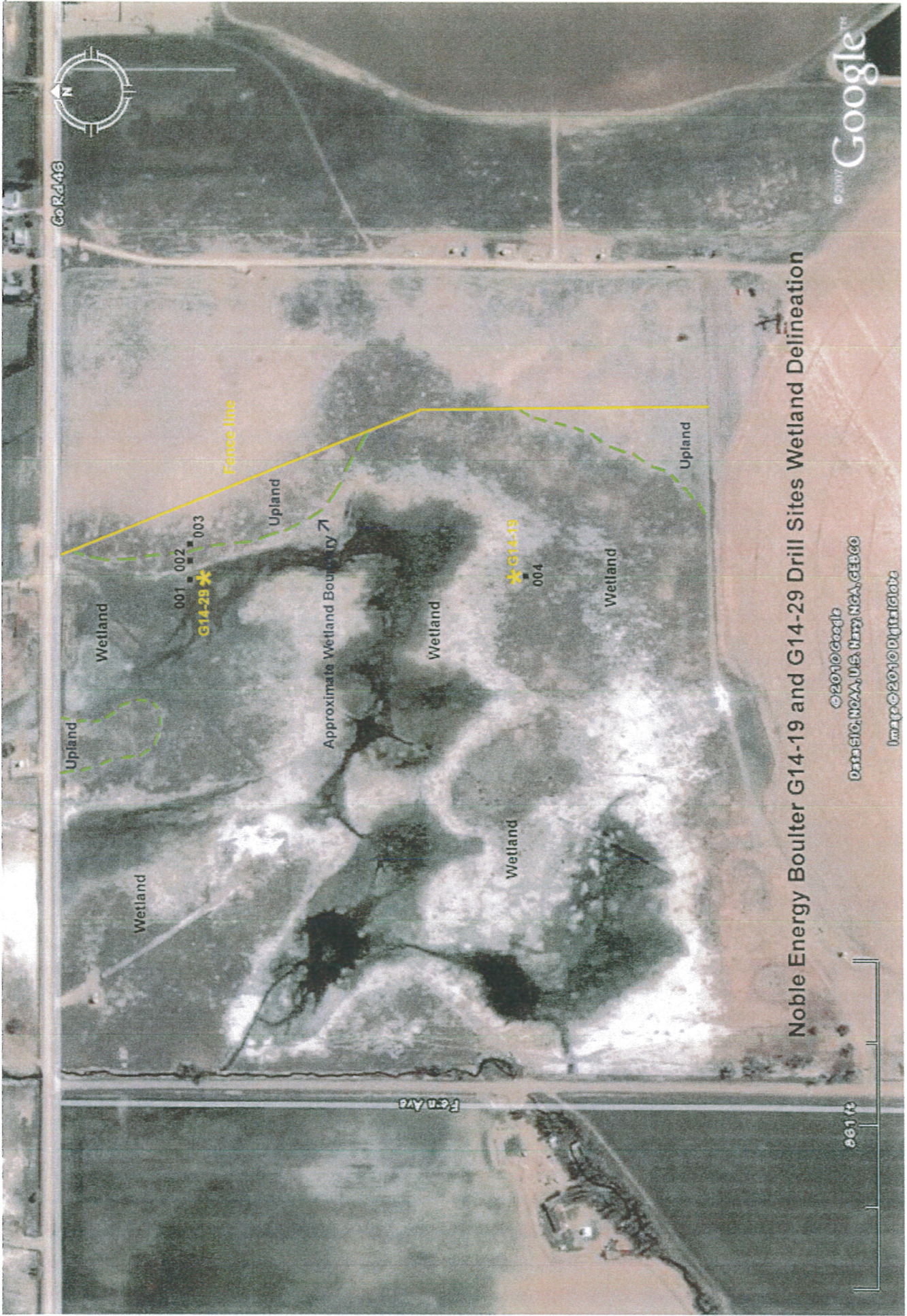
Noble Energy Boulder G14-19 and G14-29 Drill Sites Wetland Delineation