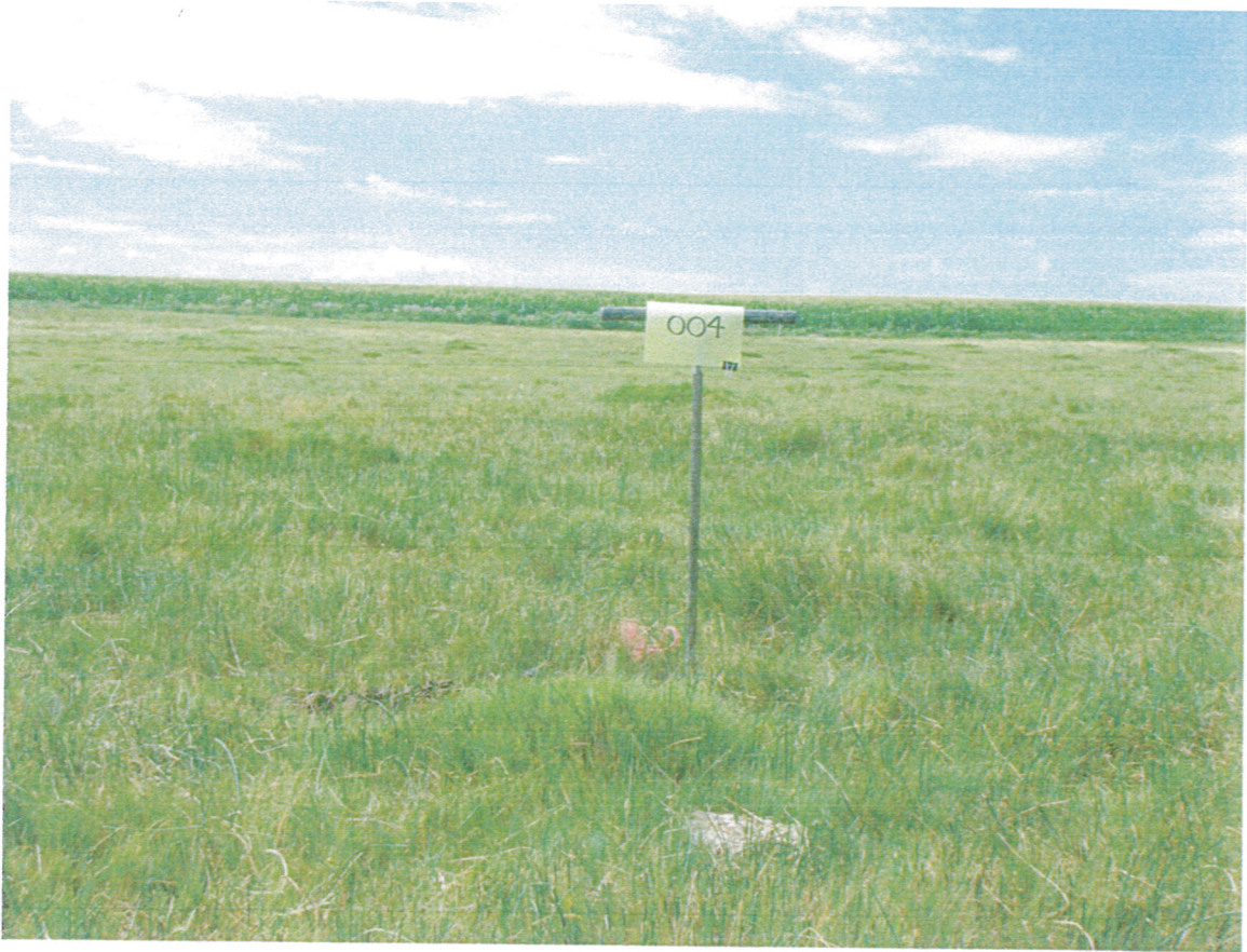
Figure 2. – Sample Point 004 - Looking South