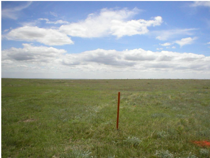
PAD LOCATION FACING SOUTH