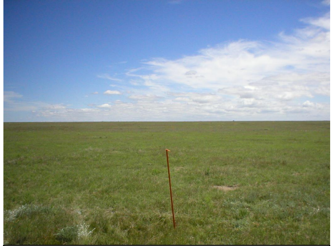
PAD LOCATION FACING EAST