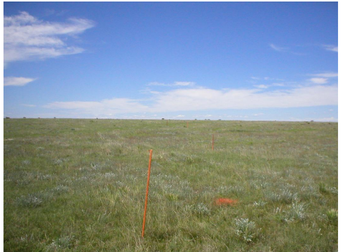
PAD LOCATION FACING WEST