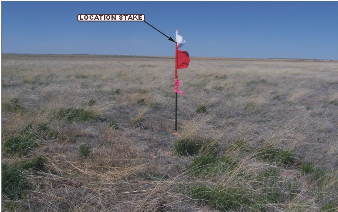
PHOTO: VIEW OF LOCATION STAKE