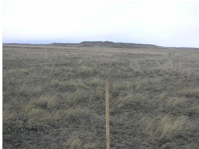
VEGETATION SITE FACING NORTH

SLAWSON EXPLORATION COMPANY, INC. PAD LOCATION: NW1/4 NW1/4, SECTION 6, T11N R66W WELD COUNTY, COLORADO REFERENCE LOCATION: NW1/4 NW1/4, SECTION 6, T11N R66W LAT: 40.954730° LONG: -104.828669°