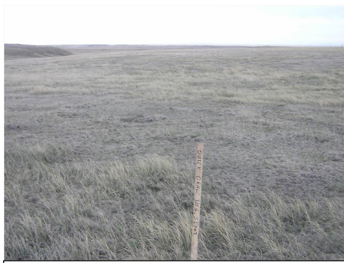
VEGETATION SITE FACING SOUTH