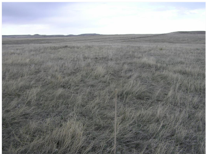
VEGETATION SITE FACING EAST