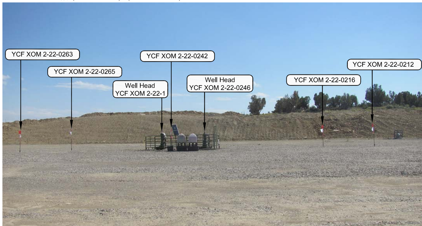
PHOTO LOCATION: LATITUDE LONGITUDE NAD 83: (40° 00' 05.66"N) (108° 21' 37.89"W)