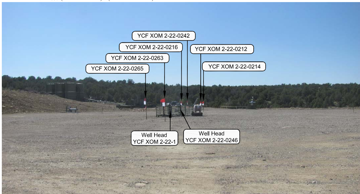
PHOTO LOCATION: LATITUDE LONGITUDE NAD 83: (40° 00' 04.19"N) (108° 21' 35.63"W)