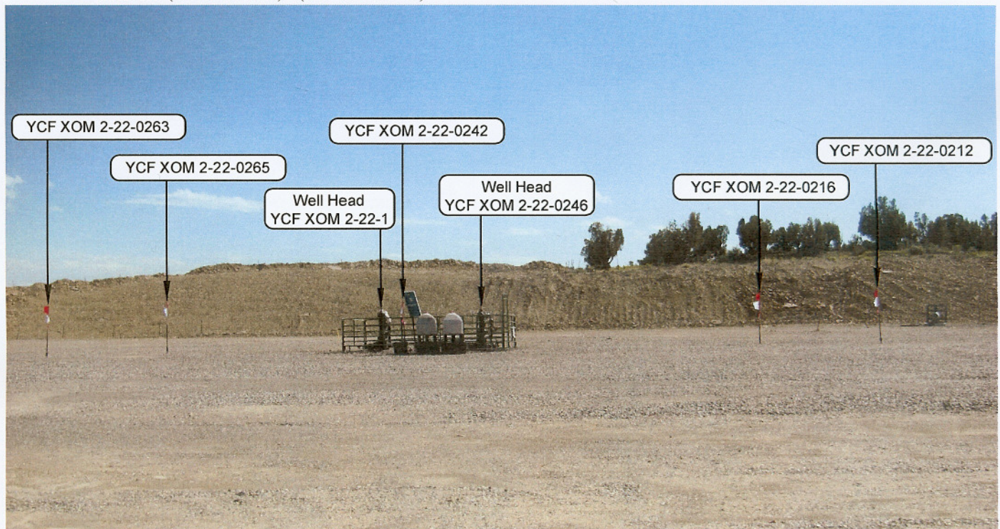
PHOTO LOCATION: LATITUDE LONGITUDE NAD 83: (40° 00' 05.66"N) (108° 21' 37.89"W)