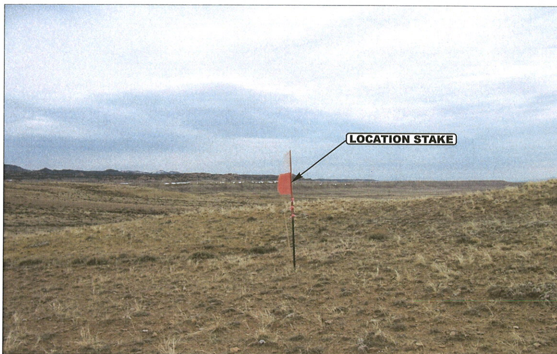
PHOTO: VIEW OF LOCATION STAKE