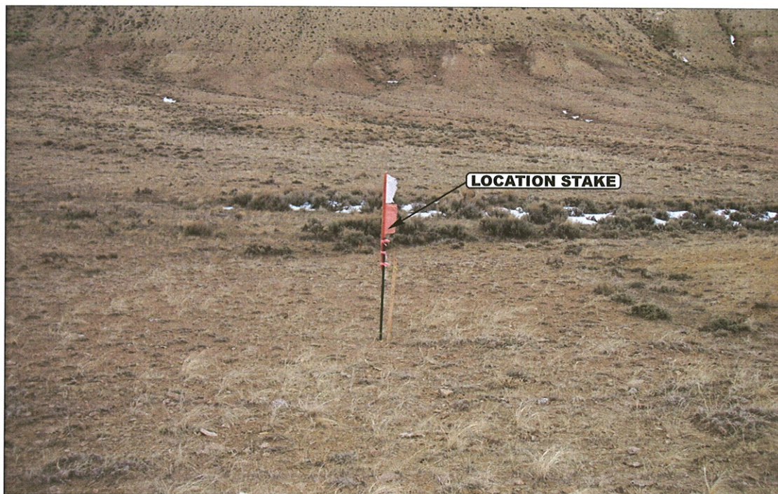
PHOTO: VIEW OF LOCATION STAKE