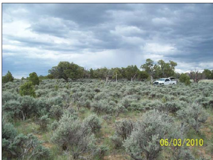
Looking East Towards Reference Point