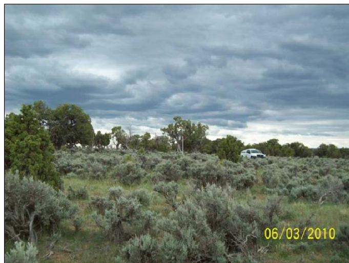
Looking South Towards Reference Point