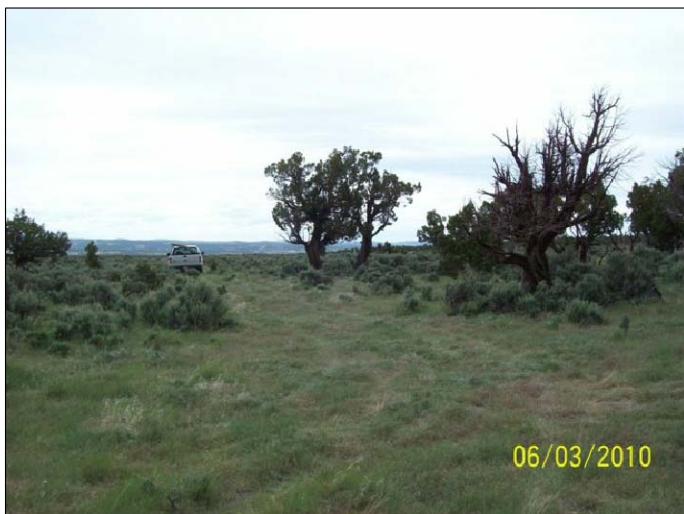
Looking North Towards Reference Point