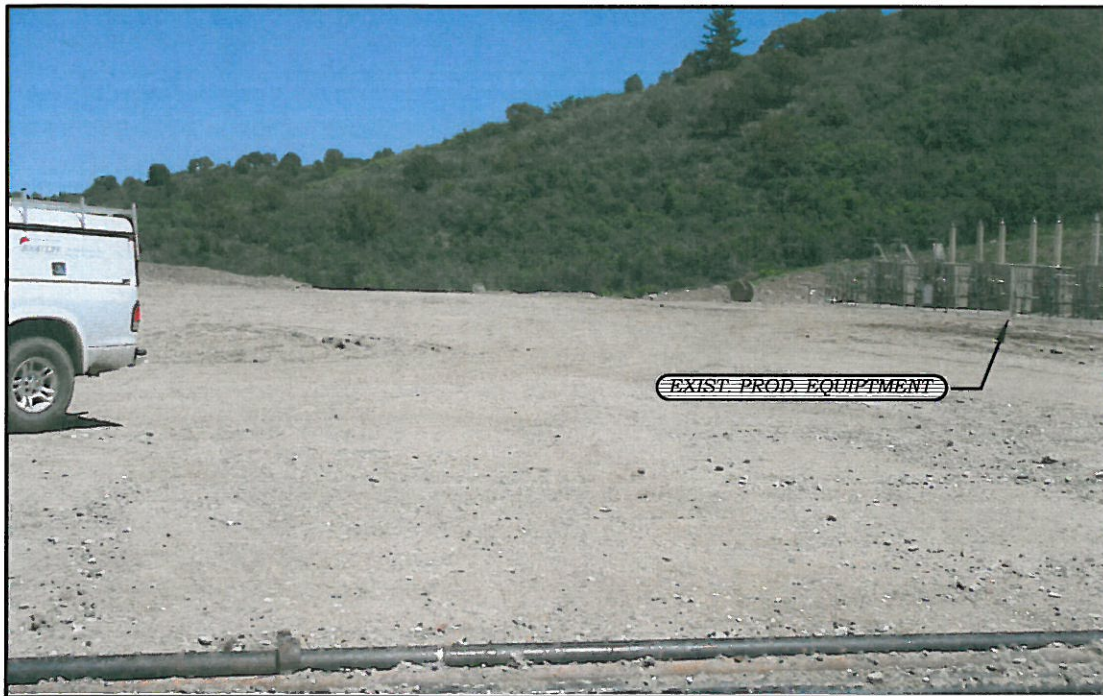
PHOTO: VIEW FROM PAD CENTER

SR 334-9, SR 534-9, SR 434-9, SR 444-9, SR 344-9, SR 44-9, SR 544-9, SR 543-9, SR 443-9, SR 34-9, SR 433-9, SR 333-9, SR 532-9