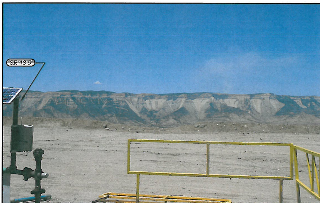
PHOTO: VIEW FROM PAD CENTER

SR 334-9, SR 534-9, SR 434-9, SR 444-9, SR 344-9, SR 44-9, SR 544-9, SR 543-9, SR 443-9, SR 34-9, SR 433-9, SR 333-9, SR 532-9