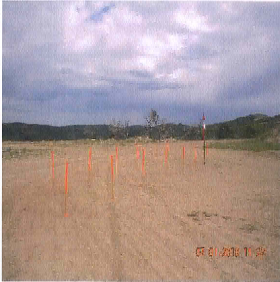
WELL LOCATION LOOKING NORTH JULY 1, 2010