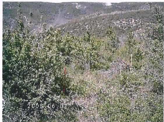
WELL LOCATION LOOKING SOUTH JUNE 2, 2008