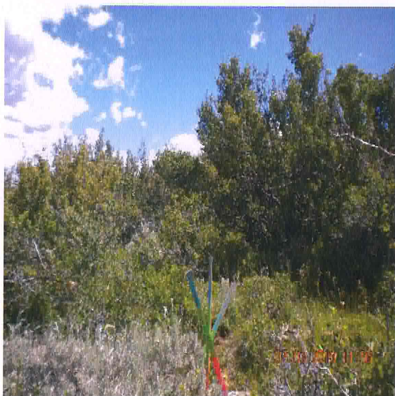
REFERENCE AREA LOOKING EAST JULY 3, 2010