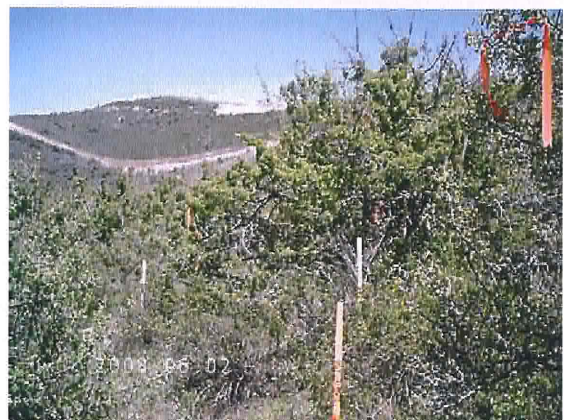
WELL LOCATION LOOKING WEST JUNE 2, 2008