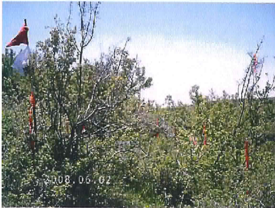
WELL LOCATION LOOKING NORTH JUNE 2, 2008