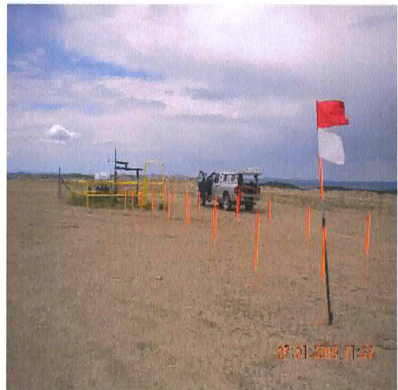
WELL LOCATION LOOKING WEST JULY 1, 2010