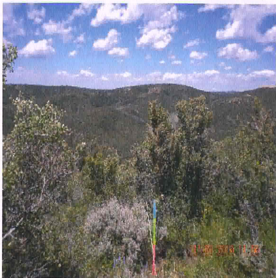
REFERENCE AREA LOOKING NORTH JULY 3, 2010