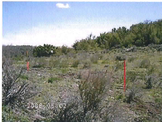
ACCESS ROAD TO PAD JUNE 2, 2008