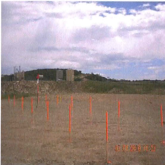
WELL LOCATION LOOKING EAST JULY 1, 2010