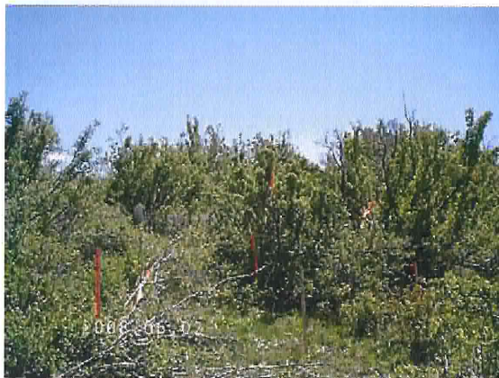
WELL LOCATION LOOKING EAST JUNE 2, 2008