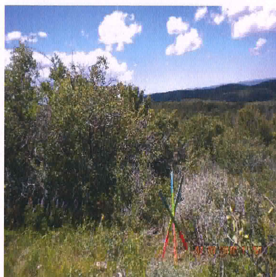
REFERENCE AREA LOOKING WEST JULY 3, 2010