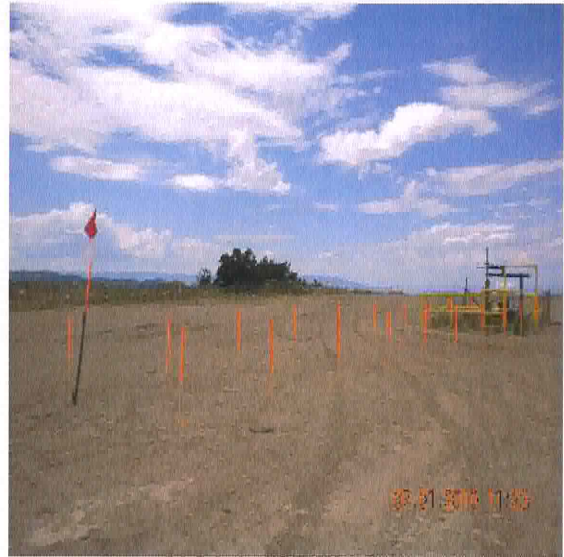
WELL LOCATION LOOKING SOUTH JULY 1, 2010