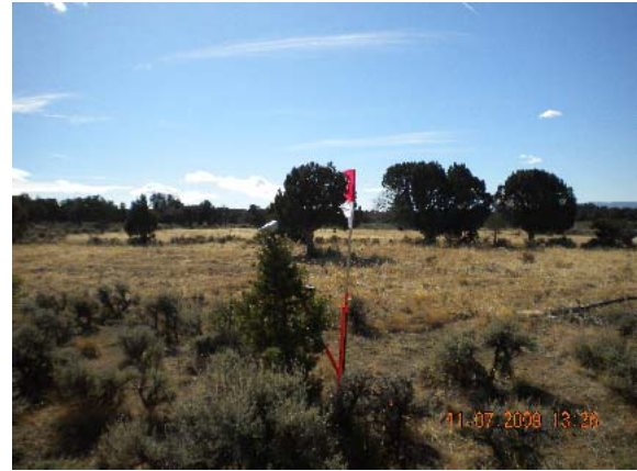
LOOKING SOUTH TOWARD LOCATION