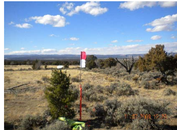
LOOKING WEST TOWARD LOCATION