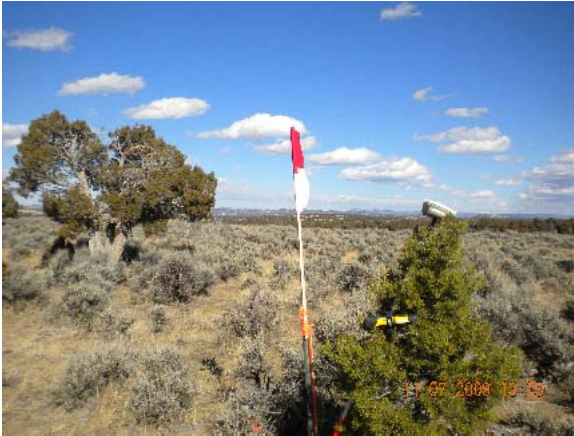
LOOKING NORTH TOWARD LOCATION