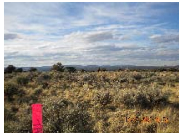
ACCESS ROAD AT TAKEOFF

PICTURES TAKEN ON NOVEMBER 7, 2009 FEDERAL RGU 23-23-198 PAD