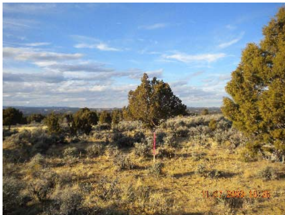
ACCESS ROAD AT PAD