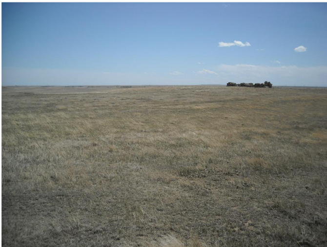
VEGETATION SITE FACING SOUTH