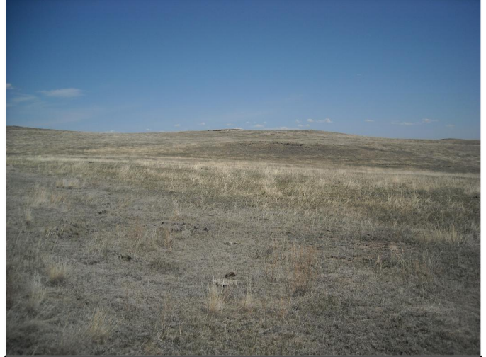
VEGETATION SITE FACING EAST