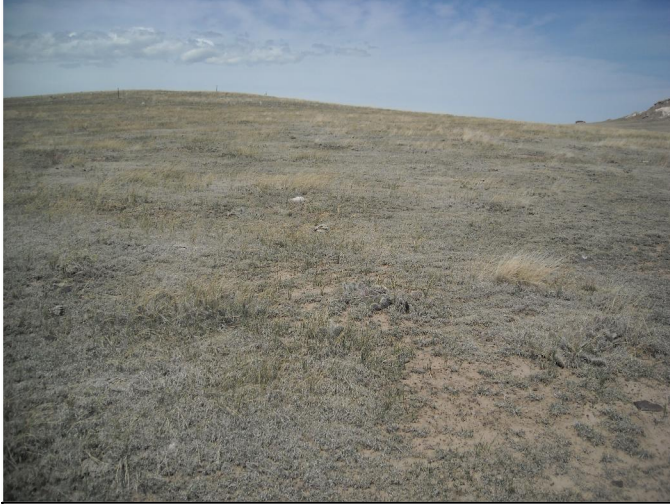
VEGETATION SITE FACING NORTH

SLAWSON EXPLORATION COMPANY, INC. PAD LOCATION: NW1/4 NE1/4, SECTION 10, T11N R67W WELD COUNTY, COLORADO REFERENCE LOCATION: NW/14 NE1/4, SECTION 10, T11N R67W REFERENCE LOCATION LAT: 40.941128° LONG: -104.873681°