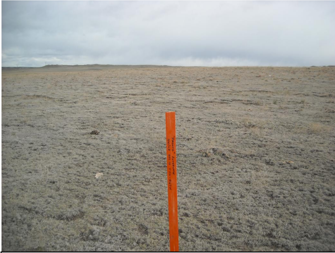
PAD LOCATION FACING NORTH

SLAWSON EXPLORATION COMPANY, INC. PAD LOCATION: NW1/4 NE1/4, SECTION 10, T11N R67W WELD COUNTY, COLORADO