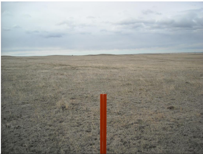
PAD LOCATION FACING SOUTH