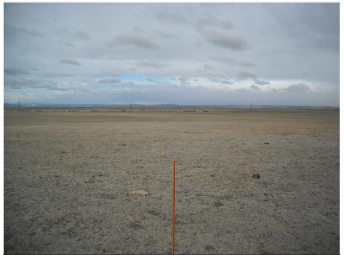
PAD LOCATION FACING WEST