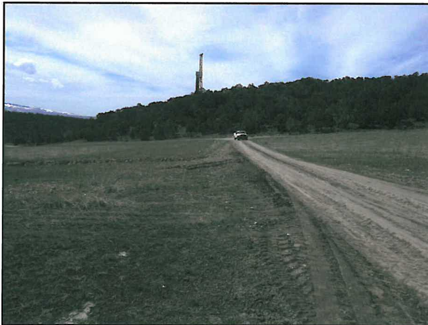
PHOTO: VIEW OF ACCESS ROAD