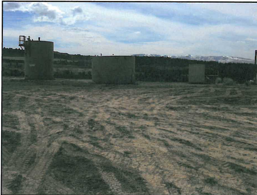
PHOTO: VIEW FROM PAD CENTER