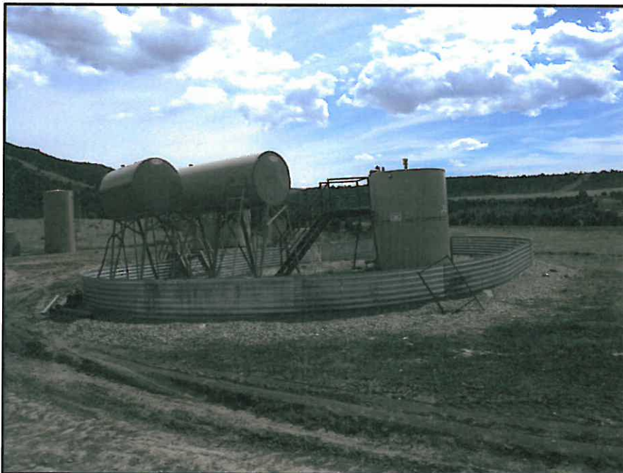
PHOTO: VIEW FROM PAD CENTER