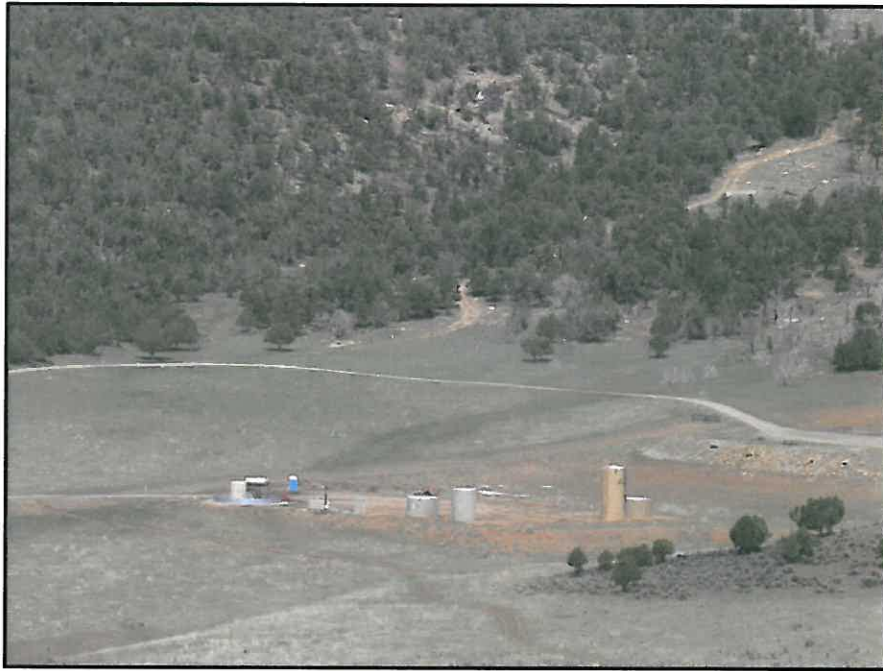
PHOTO: VIEW OF OVERALL PAD