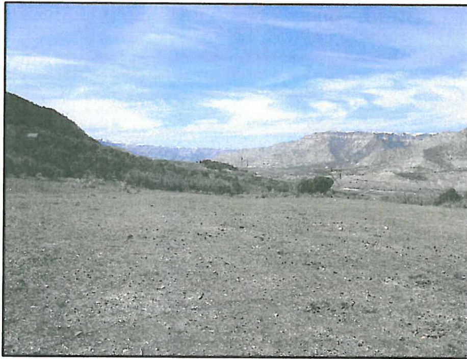
PHOTO: VIEW FROM PAD CENTER

RWF 444-31, RWF 344-31, RWF 443-31, RWF 343-31, RWF 43-31, RWF 433-31, RWF 333-31, RWF 434-31, RWF 334-31, RWF 44-31, RWF 543-31, RWF 34-31, RWF 533-31, RWF 33-31