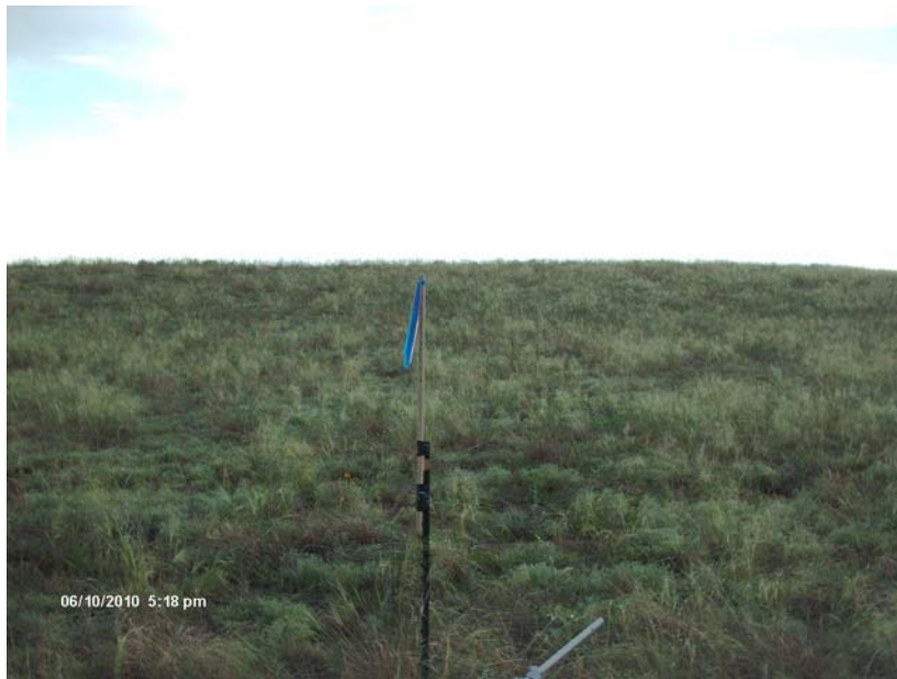
ANTELOPE 12-19 SW ¼ NW ¼ SEC. 19 T5N R62W LOOKING WEST JUNE 10, 2010