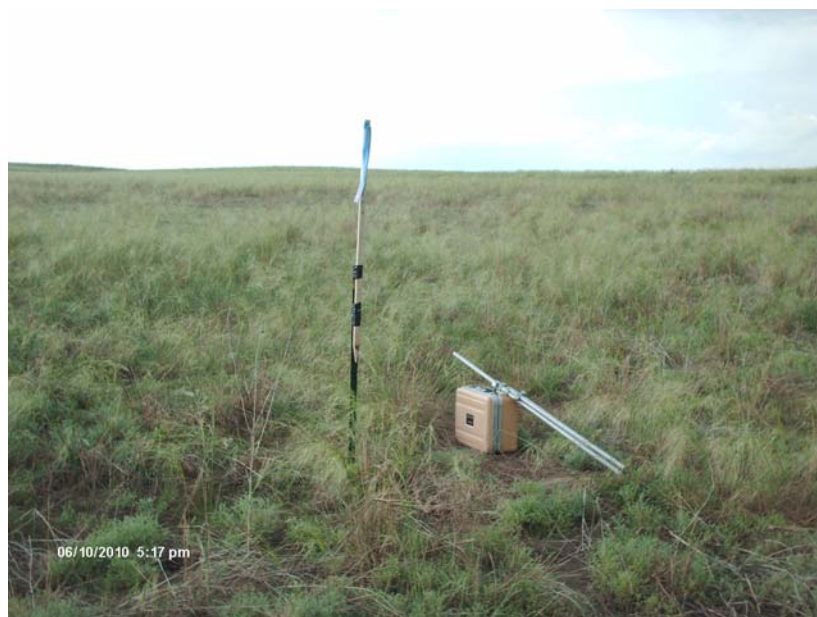
ANTELOPE 12-19 SW 1/4 NW 1/4 SEC. 19 T5N R62W LOOKING NORTH JUNE 10,2010