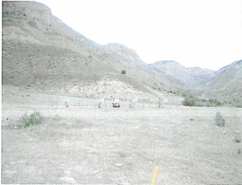
WELL PAD LOOKING NORTH

EXXON/MOBIL WELL PAD GM 24-27 EXISTING WELLS: GM 24-27, GM 324-27, GM 424-27, GM 524-27 PROPOSED WELLS: GM 13-27, GM 23-27, GM 312-27, GM 313-27, GM 323-27, GM 333-27, GM 412-27, GM 413-27, GM 422-27, GM 423-27, GM 512-27, GM 513-27, GM 523-27 PHOTOS TAKEN 4/21/2010