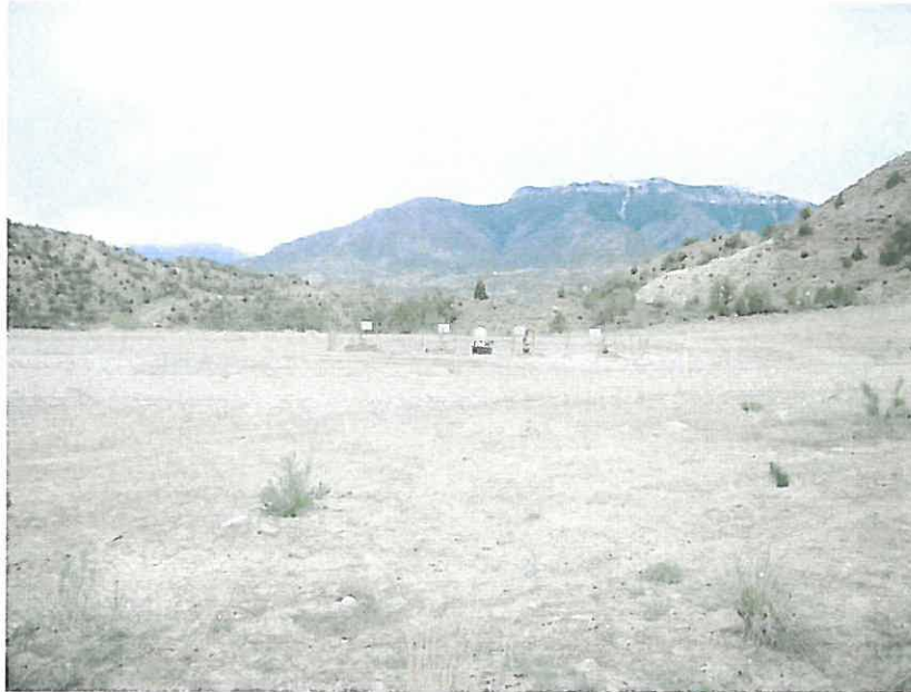
WELL PAD LOOKING SOUTH

EXXON/MOBIL WELL PAD GM 24-27 EXISTING WELLS: GM 24-27, GM 324-27, GM 424-27, GM 524-27 PROPOSED WELLS: GM 13-27, GM 23-27, GM 312-27, GM 313-27, GM 323-27, GM 333-27, GM 412-27, GM 413-27, GM 422-27, GM 423-27, GM 512-27, GM 513-27, GM 523-27 PHOTOS 4/21/2010