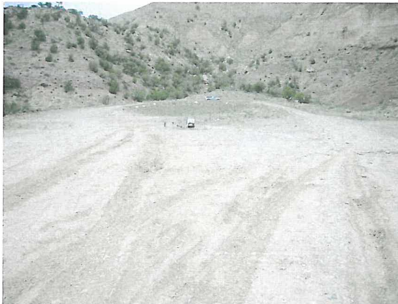
WELL PAD LOOKING WEST