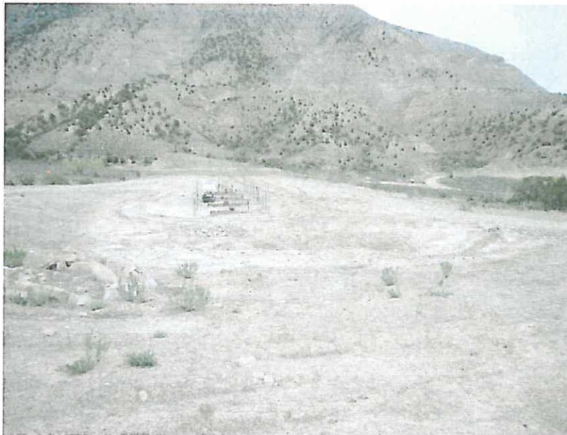
WELL PAD LOOKING EAST