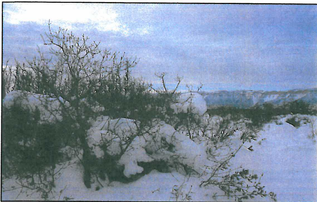
PHOTO: VIEW FROM PAD CENTER

SP 331-14, SP 431-14, SP 531-14, SP 32-14, SP 332-14, SP 432-14, SP 532-14, SP 542-14, SP 31-14, SP 41-14, SP 341-14, SP 441-14, SP 541-14, SP 42-14, SP 342-14, SP 442-14