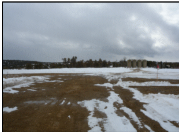
PAD LOCATION LOOKING SOUTH