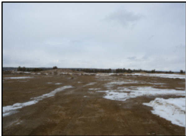
PAD LOCATION LOOKING NORTH

RG 333-14-298, RG 633-14-298, RG 532-14-298, RG 432-14-298, RG 332-14-298, RG 531-14-298, RG 431-14-298, RG 331-14-298, RG 522-14-298, RG 422-14-298, RG 22-14-298, RG 322-14-298, RG 521-14-298, RG 421-14-298, RG 321-14-298