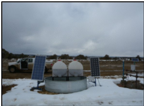
PAD LOCATION LOOKING WEST