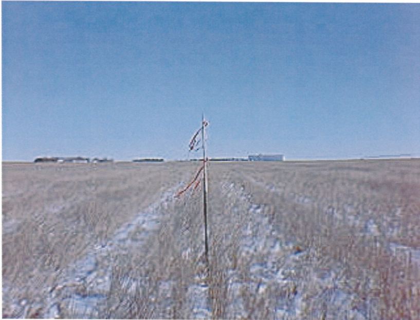
SAND PARTNERS #844-12-41 NE ¼ NE ¼ SEC. 12, T8N, R44W Looking East 29 December, 2007