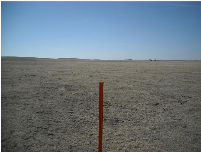
WELL LOCATION FACING SOUTH