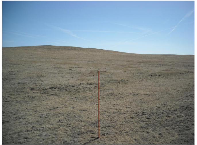
WELL LOCATION FACING EAST