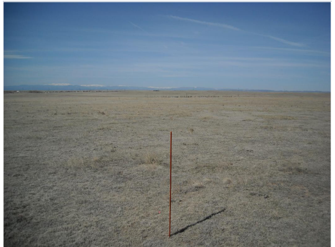
WELL LOCATION FACING WEST