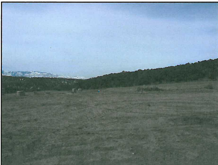
PHOTO: VIEW FROM PAD CENTER