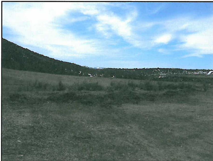
PHOTO: VIEW FROM PAD CENTER