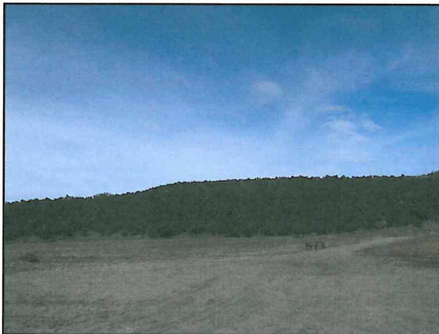
PHOTO: VIEW OF ACCESS ROAD