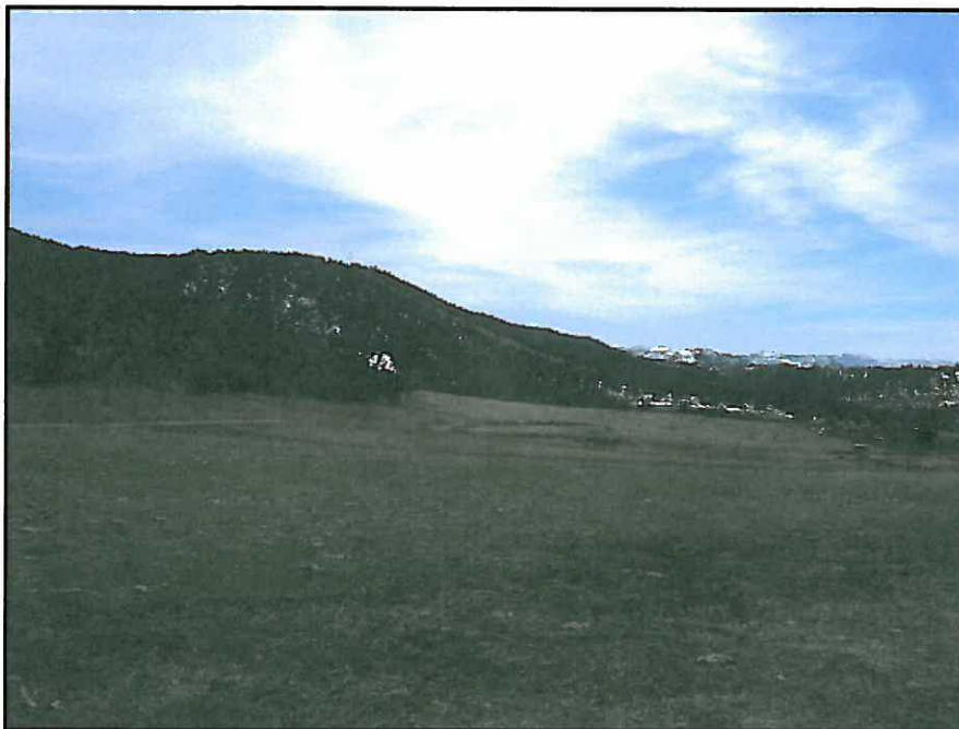
PHOTO: VIEW OF OVERALL PAD

KP 542-17, KP 442-17, KP 342-17, KP 42-17, KP 541-17, KP 432-17, KP 332-17, KP 32-17, KP 531-17