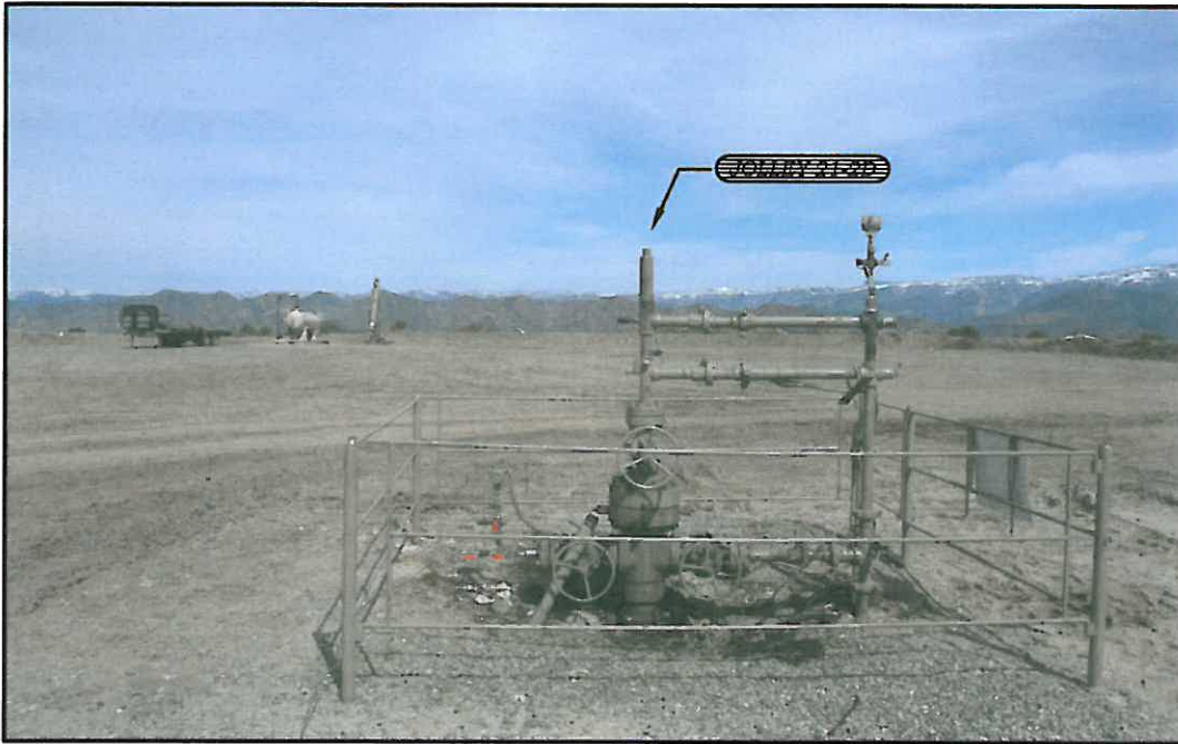
PHOTO: VIEW FROM PAD CENTER

KP 32-21, KP 332-21, KP 432-21, KP 532-21, KP 322-21, KP 522-21