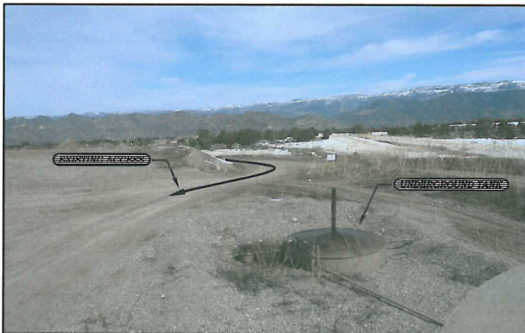
PHOTO: VIEW OF ACCESS ROAD