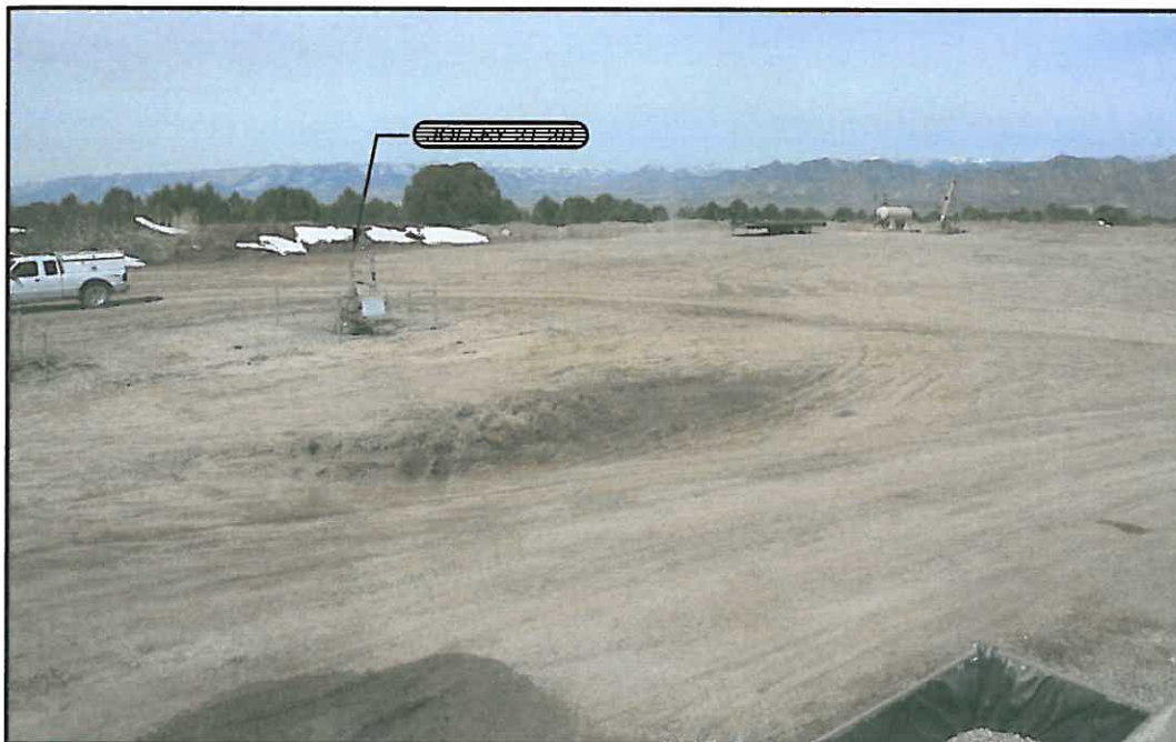
PHOTO: VIEW OF OVERALL EXISTING DRILL PAD

KP 32-21, KP 332-21, KP 432-21, KP 532-21, KP 322-21, KP 522-21