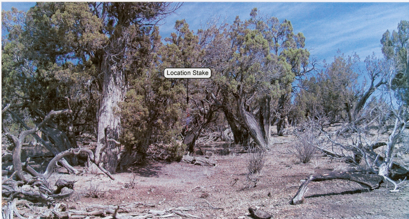
PHOTO LOCATION: LATITUDE LONGITUDE NAD 83: (39° 58' 48.98"N) (108° 20' 25.27"W)