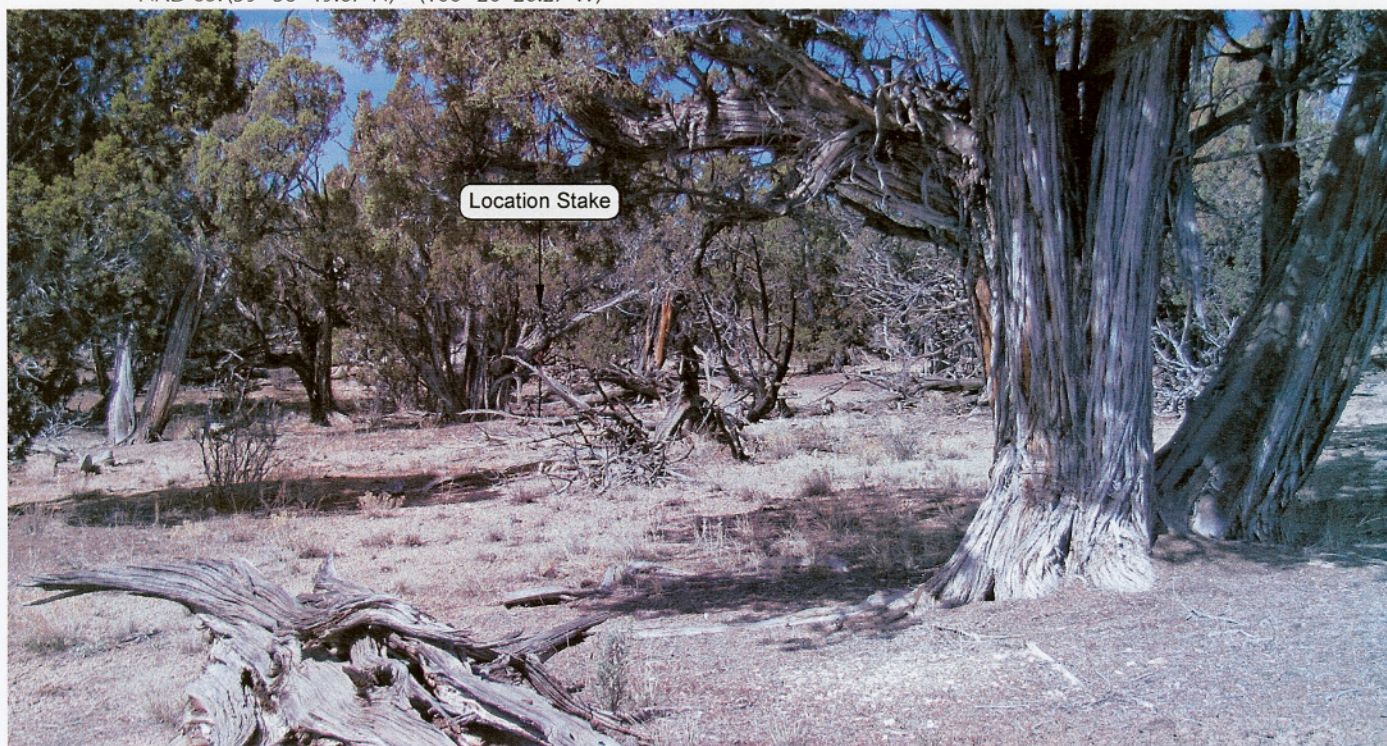
PHOTO LOCATION: LATITUDE LONGITUDE NAD 83: (39° 58' 49.66"N) (108° 20' 24.24"W)