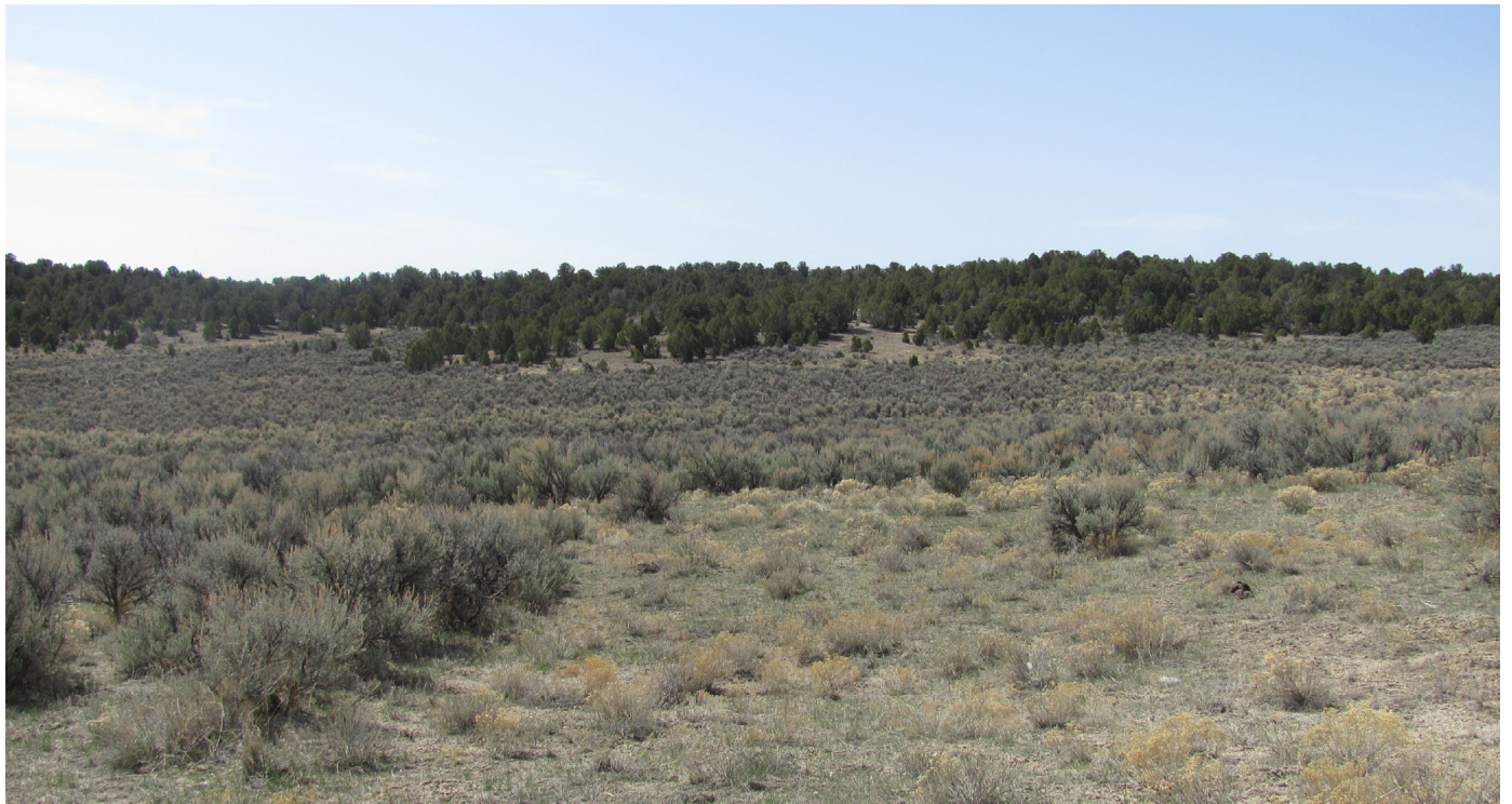
PHOTO LOCATION: LATITUDE LONGITUDE NAD 83: (40° 00' 50.11"N) (108° 22' 02.44"W)