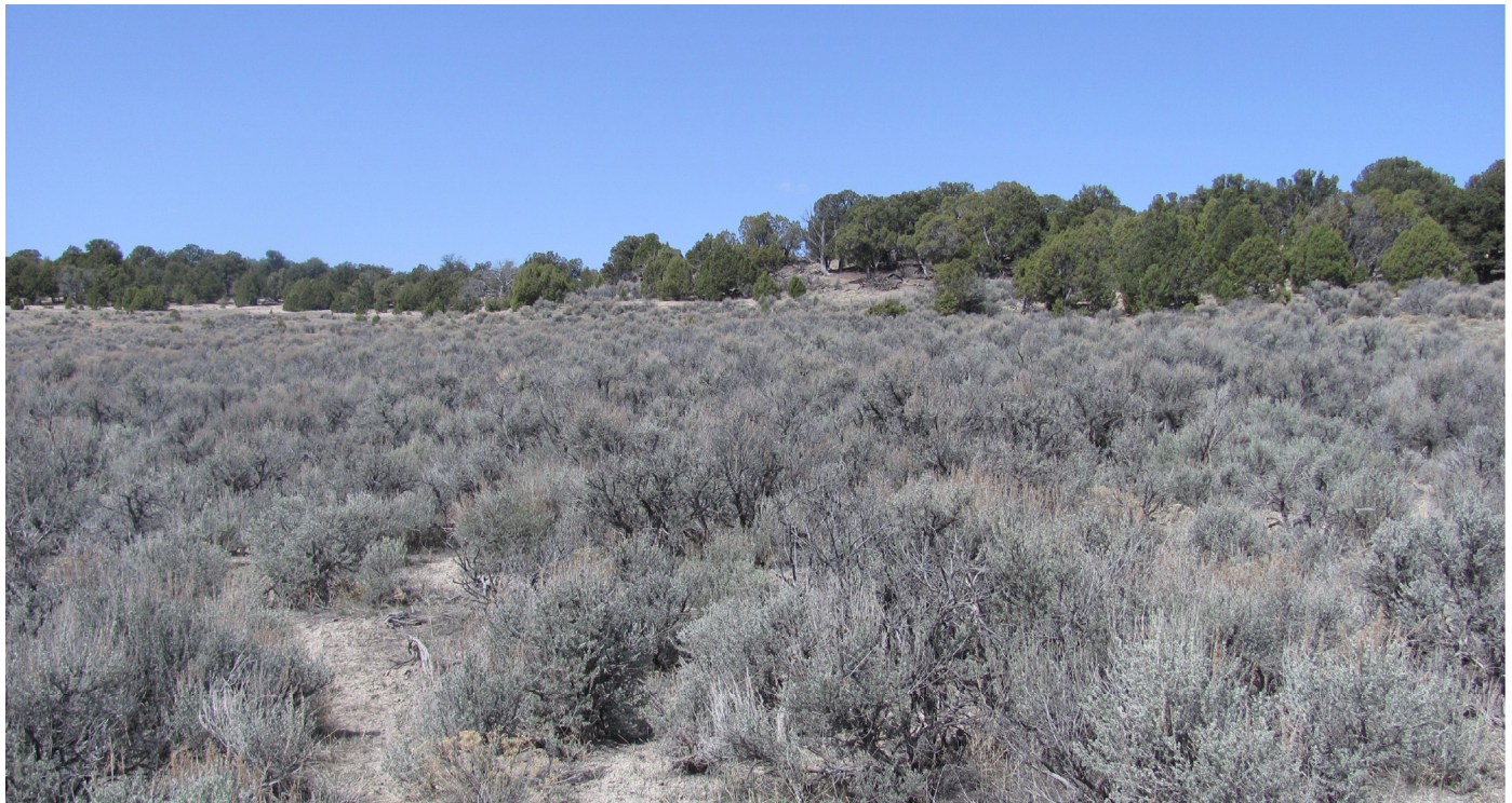
PHOTO LOCATION: LATITUDE LONGITUDE NAD 83: (40° 00' 48.12"N) (108° 21' 59.90"W)