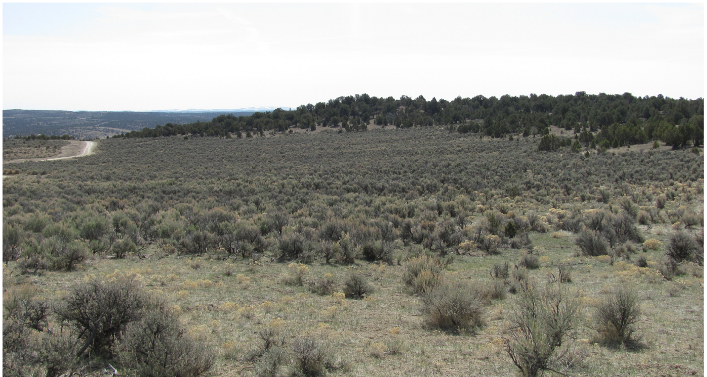
PHOTO LOCATION: LATITUDE LONGITUDE NAD 83: (40° 00' 48.16"N) (108° 22' 05.09"W)