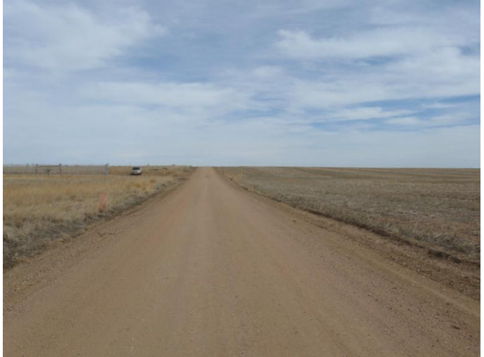
WCR 104 EAST