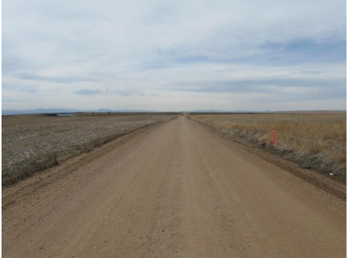
WCR 104 WEST

PAD LOCATION SE ¼ SW ¼ SECTION 16 T9N R66W WELD COUNTY COLORADO