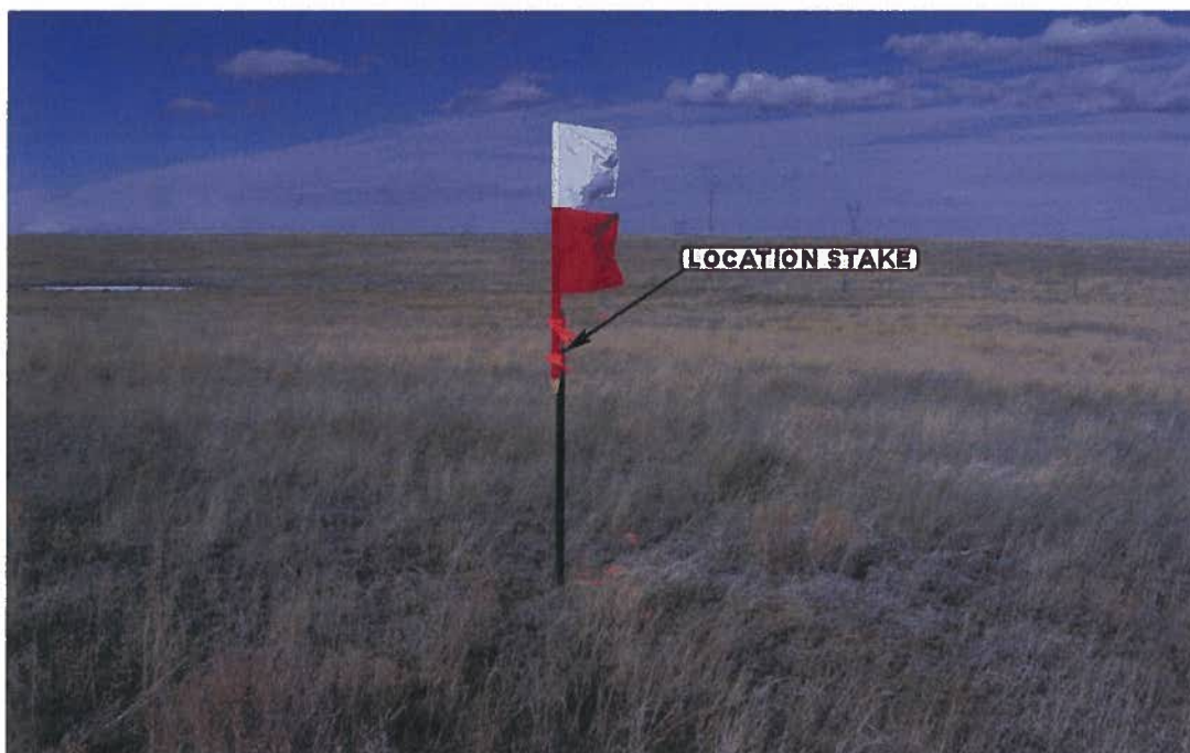
PHOTO: VIEW OF LOCATION STAKE