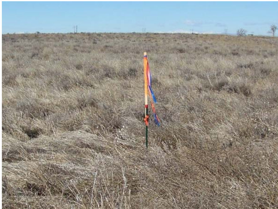
CROISSANT 24-3 SE1/4 SW1/4 SEC. 3 T4N R63W Looking WEST FEBRUARY 11, 2010