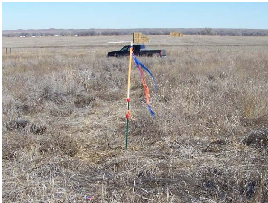
CROISSANT 24-3 SE1/4 SW1/4 SEC. 3 T4N R63W Looking NORTH FEBRUARY 11, 2010