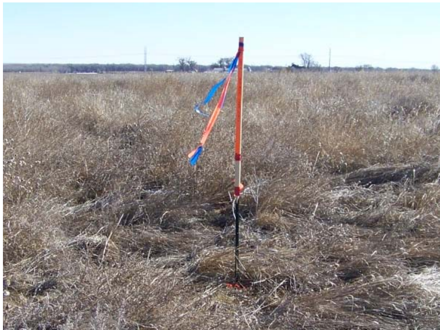
CROISSANT 24-3 SE1/4 SW1/4 SEC. 3 T4N R63W Looking EAST FEBRUARY 11, 2010