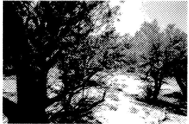
WELL LOCATION LOOKING WEST