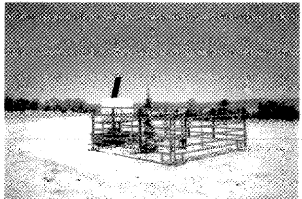
EXISTING WELL HEAD