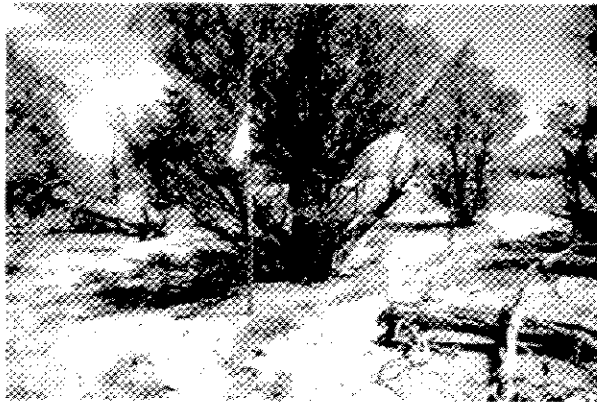
WELL LOCATION LOOKING EAST