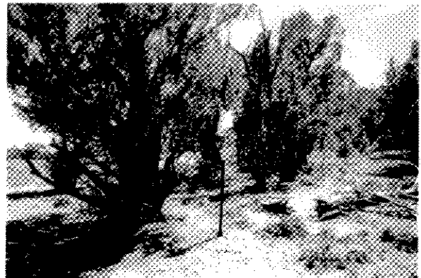
WELL LOCATION LOOKING SOUTH