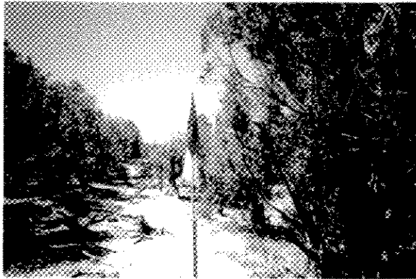
WELL LOCATION LOOKING NORTH